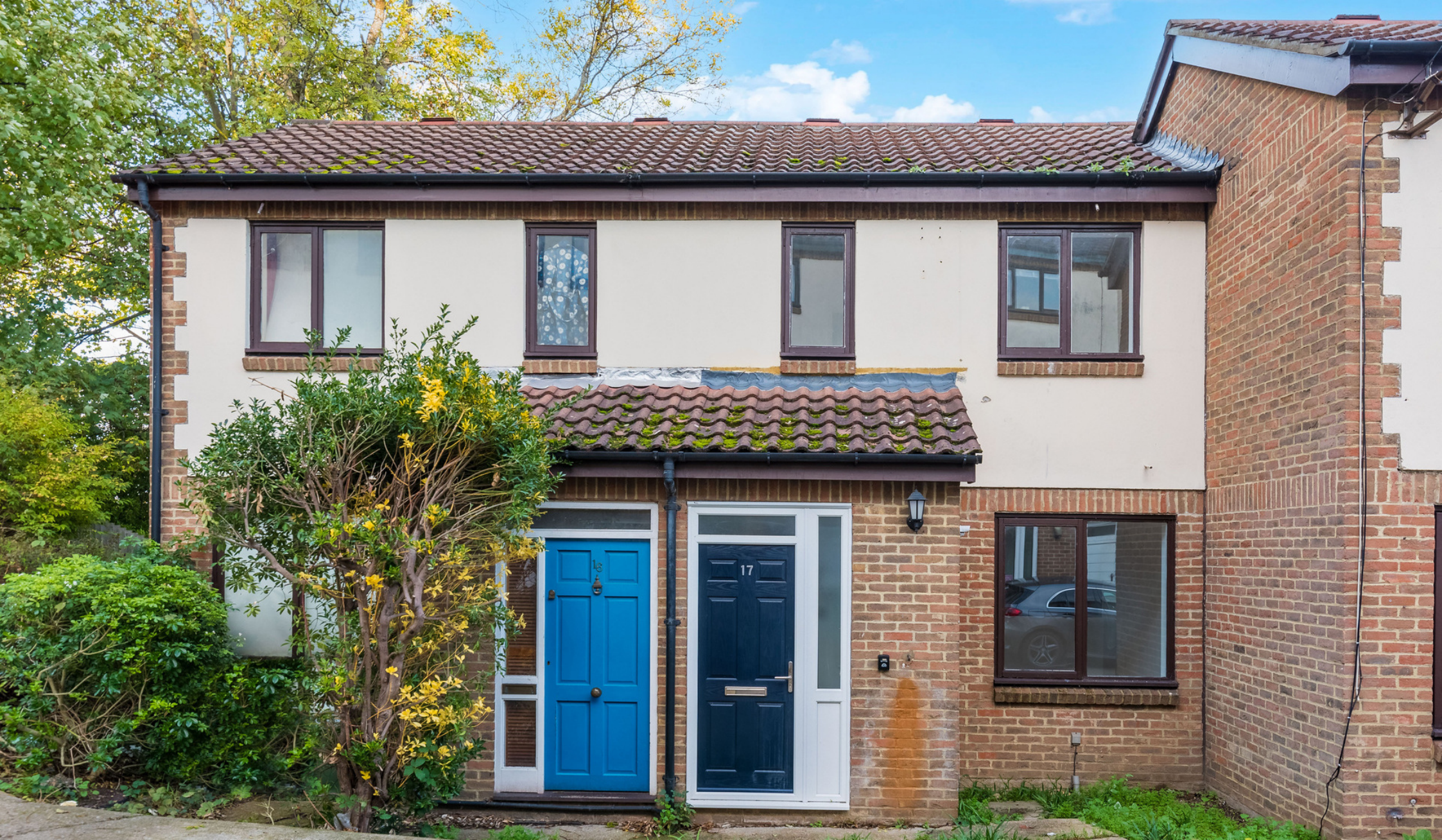
LANDSDOWNE WOOD CLOSE SE27 1 bedroom terraced house