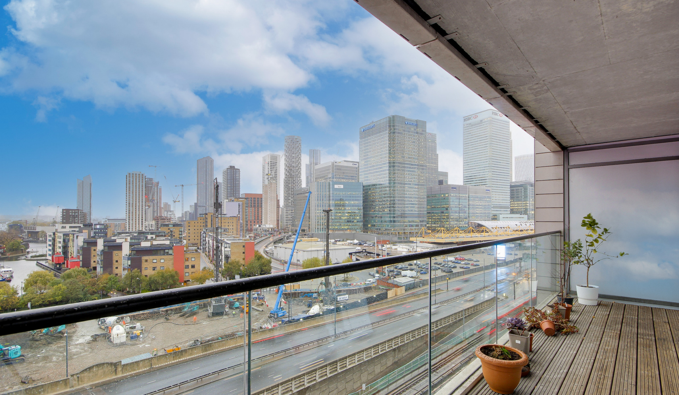
WHARFSIDE POINT SOUTH E14 1 bedroom apartment