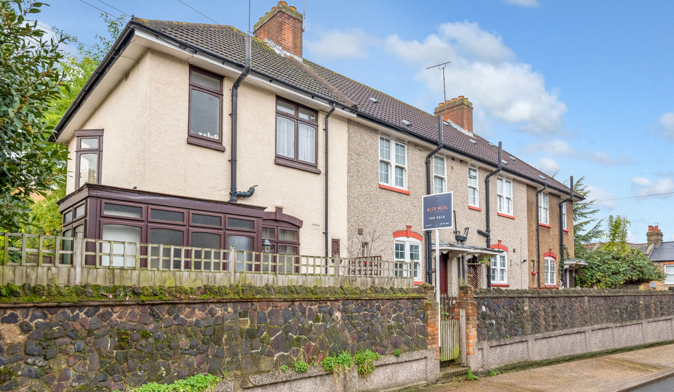
HESPERUS CRESCENT E14 2 bedroom end of terrace