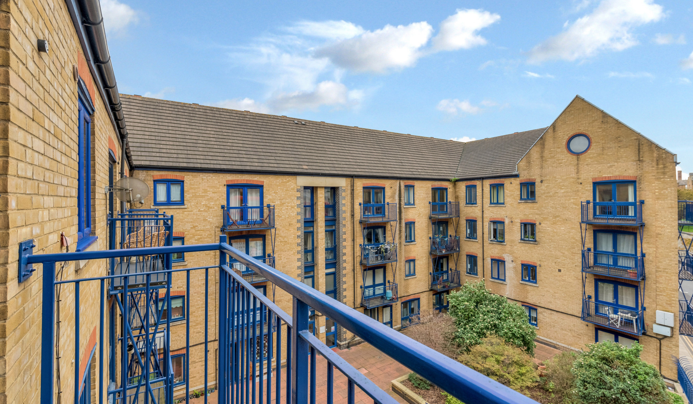
PENINSULA COURT E14 1 bedroom duplex apartment