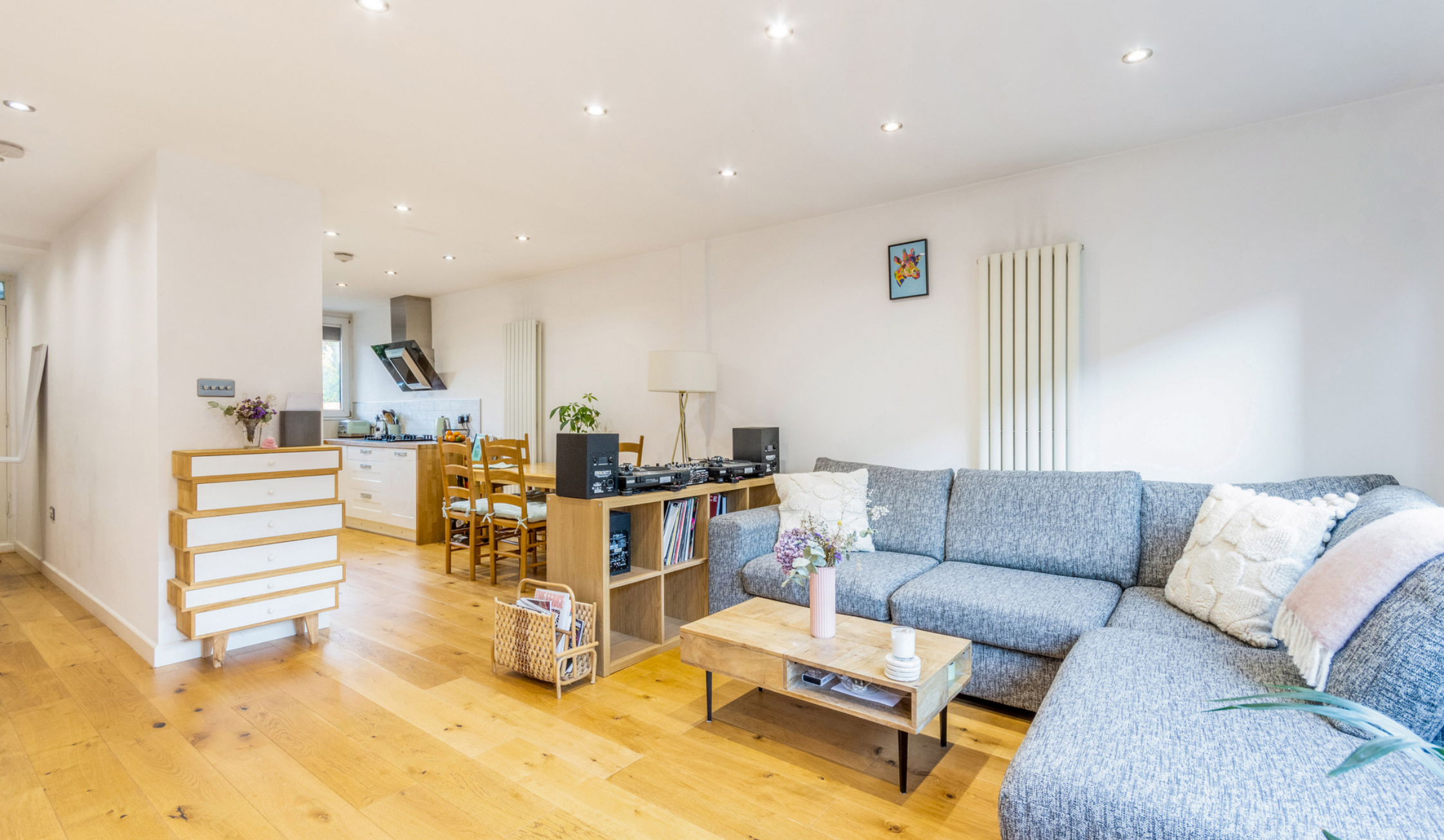
FORD STREET E3 3 bedroom duplex apartment