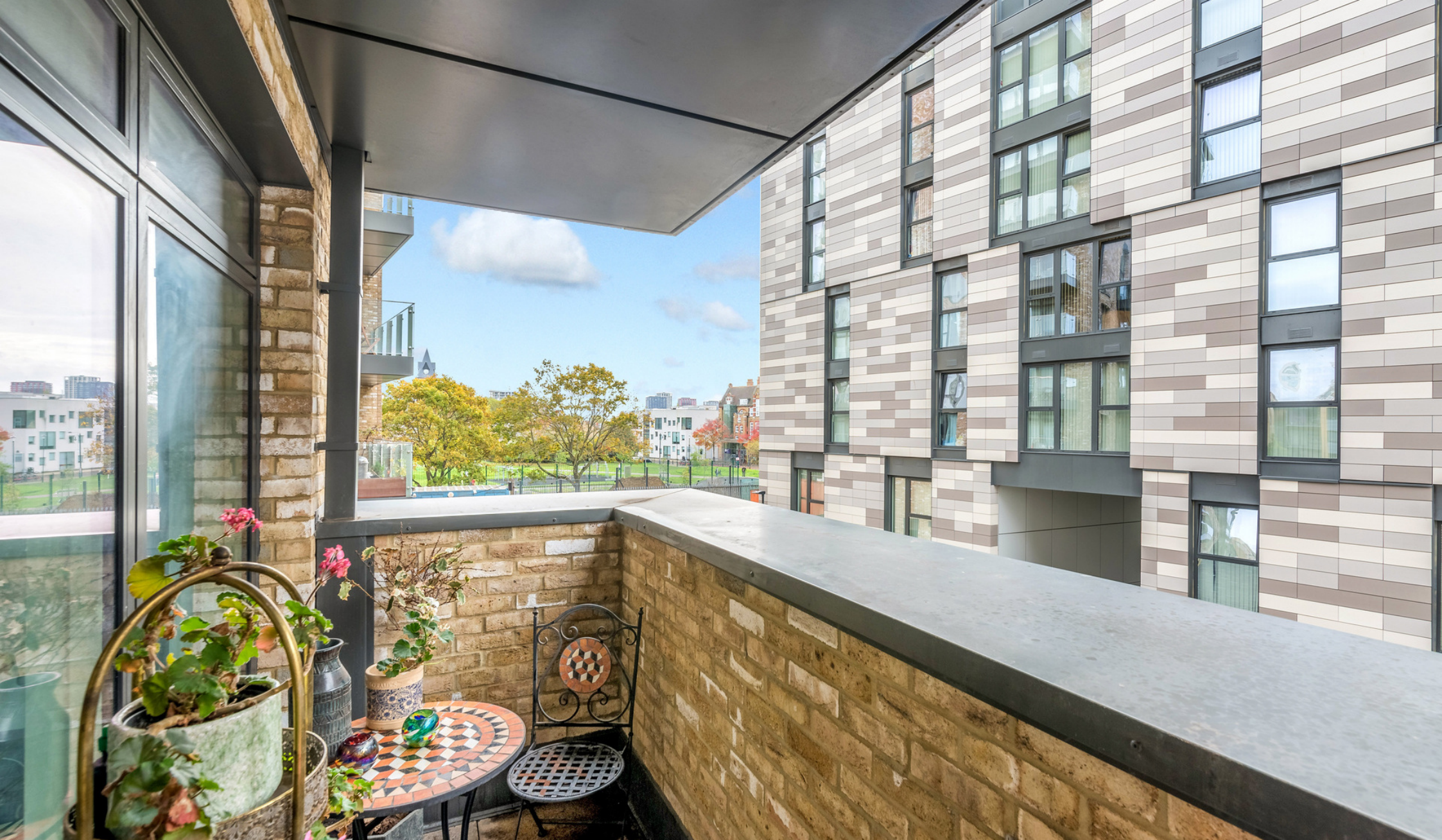
BANBURY POINT E14 1 bedroom apartment