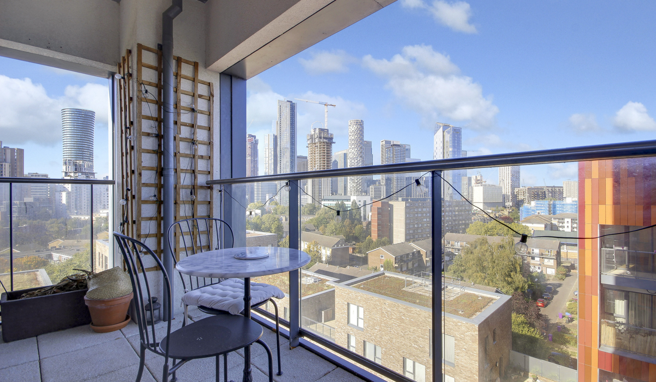
LOTUS HOUSE E14 2 bedroom apartment