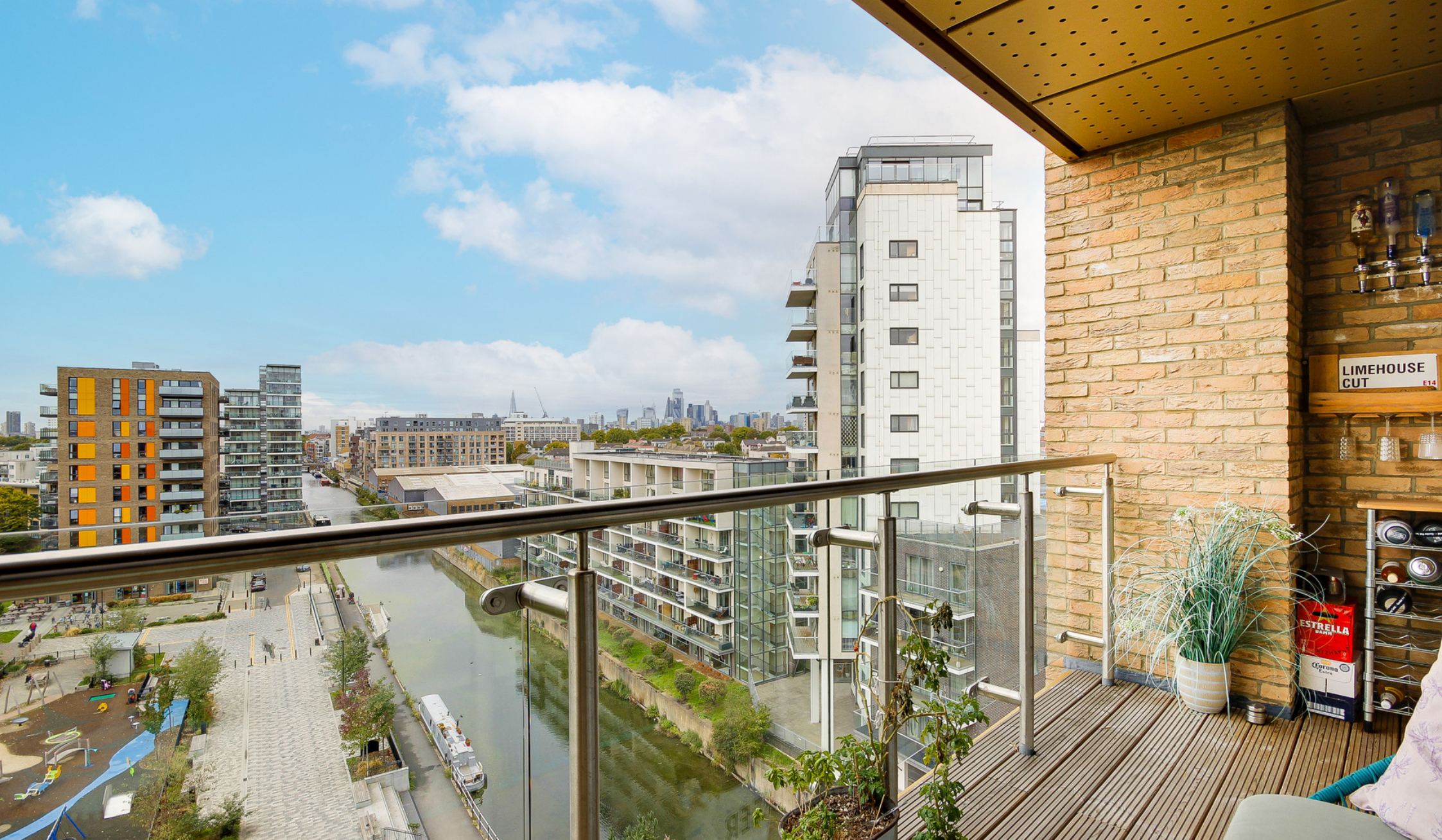
WIMHURST COURT E14 3 bedroom apartment