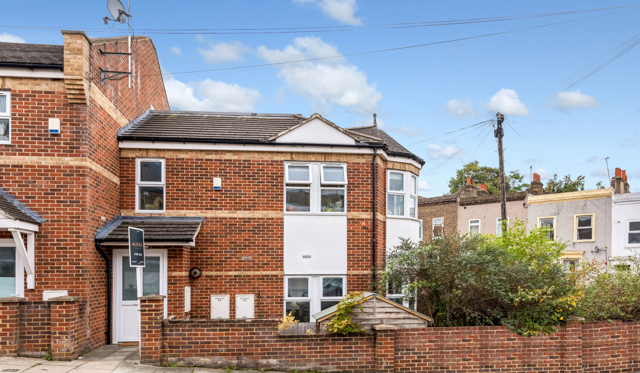
WAVERLEY CRESCENT SE18 1 bedroom maisonette