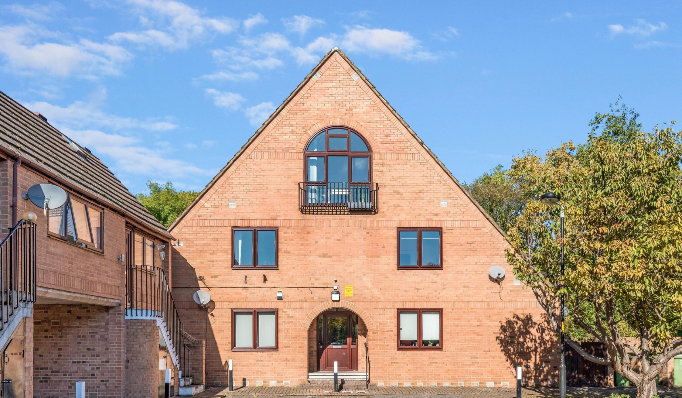
CAPSTAN WAY SE16 1 bedroom apartment