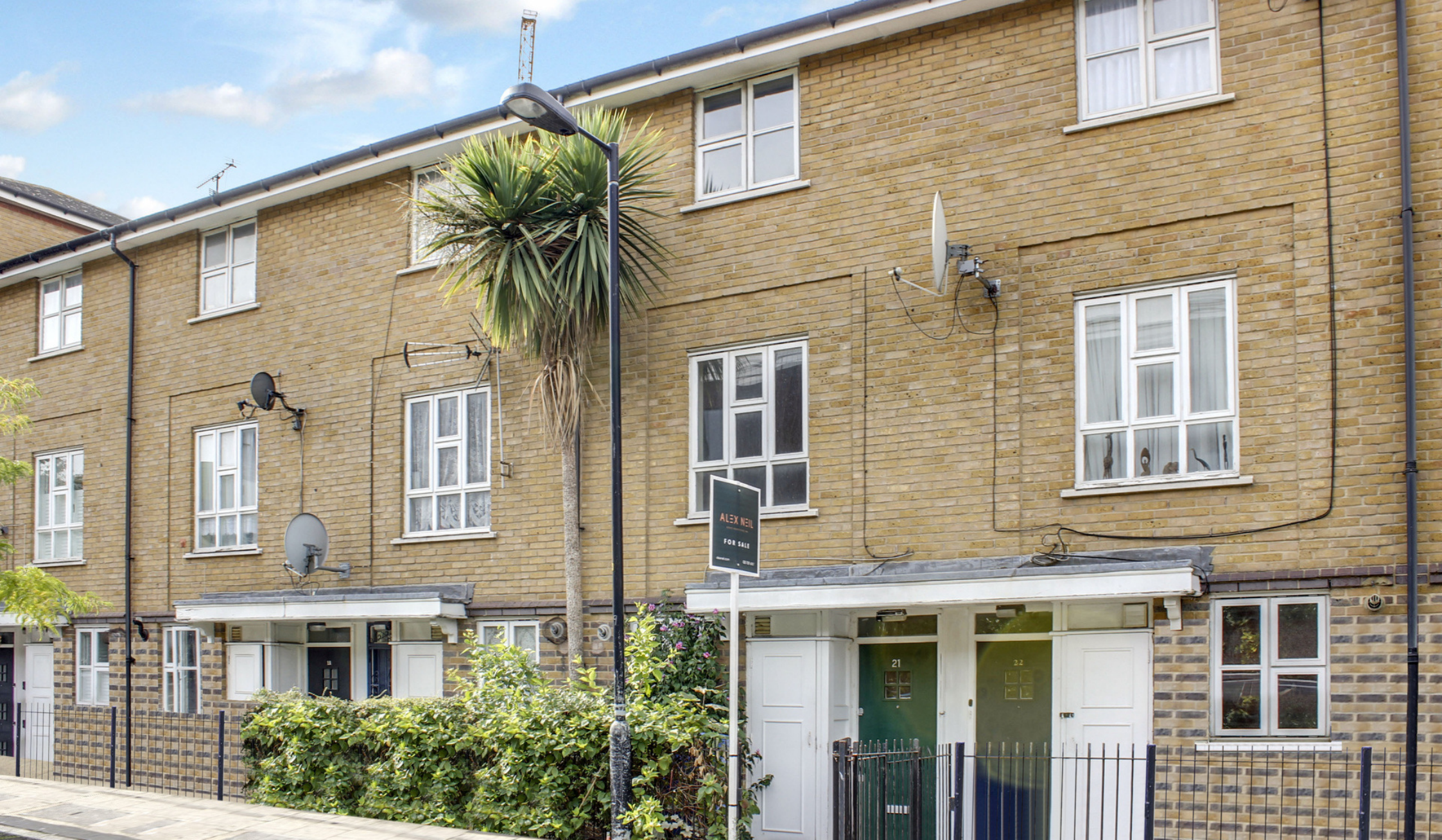
JOCELYN STREET SE15 3 bedroom town house