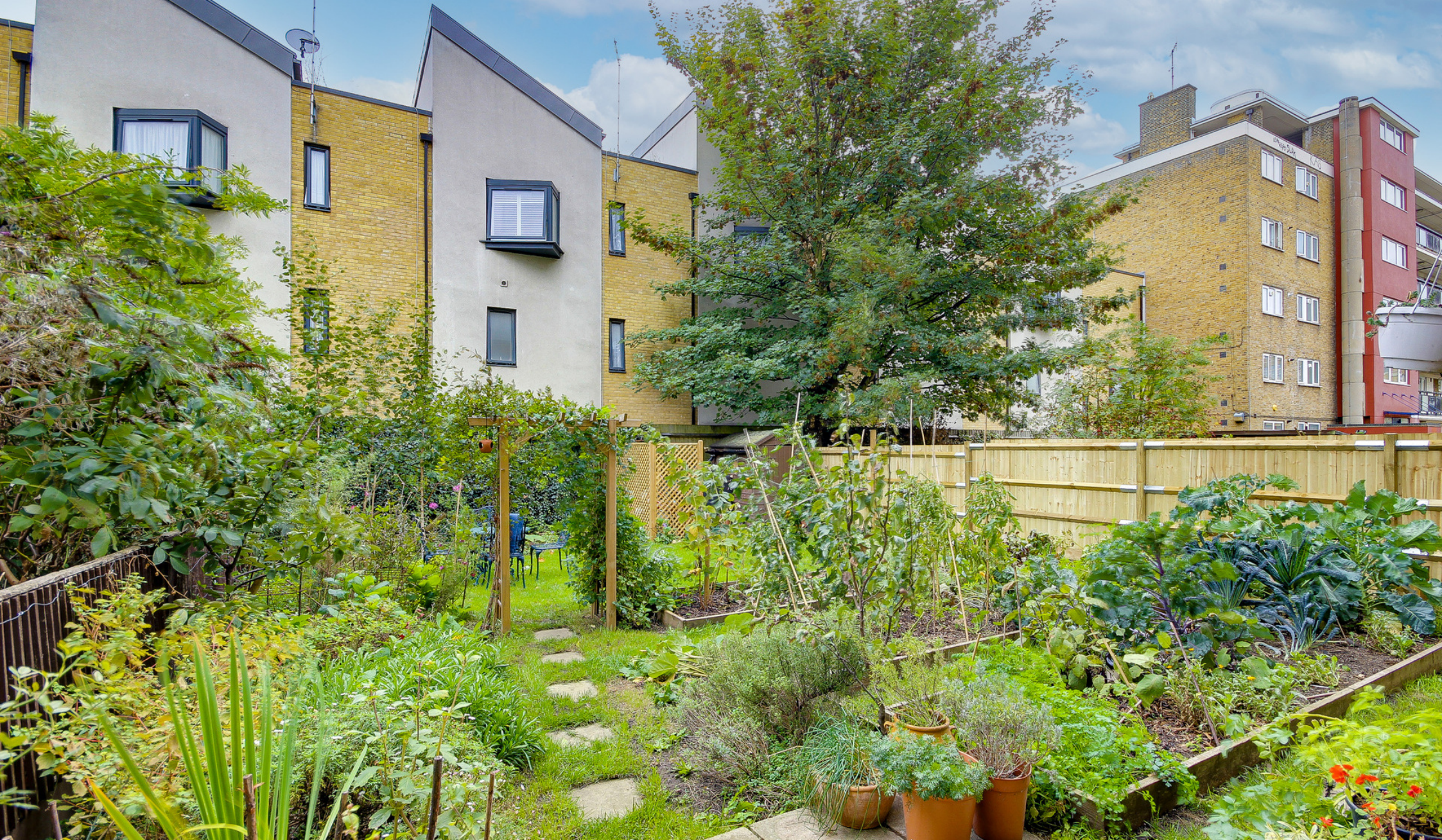
CHARLESWORTH HOUSE E14 2 bedroom apartment