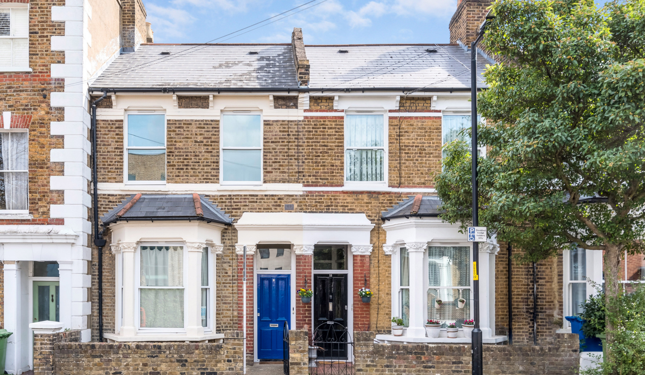
LANDCROFT ROAD SE22 1 bedroom apartment