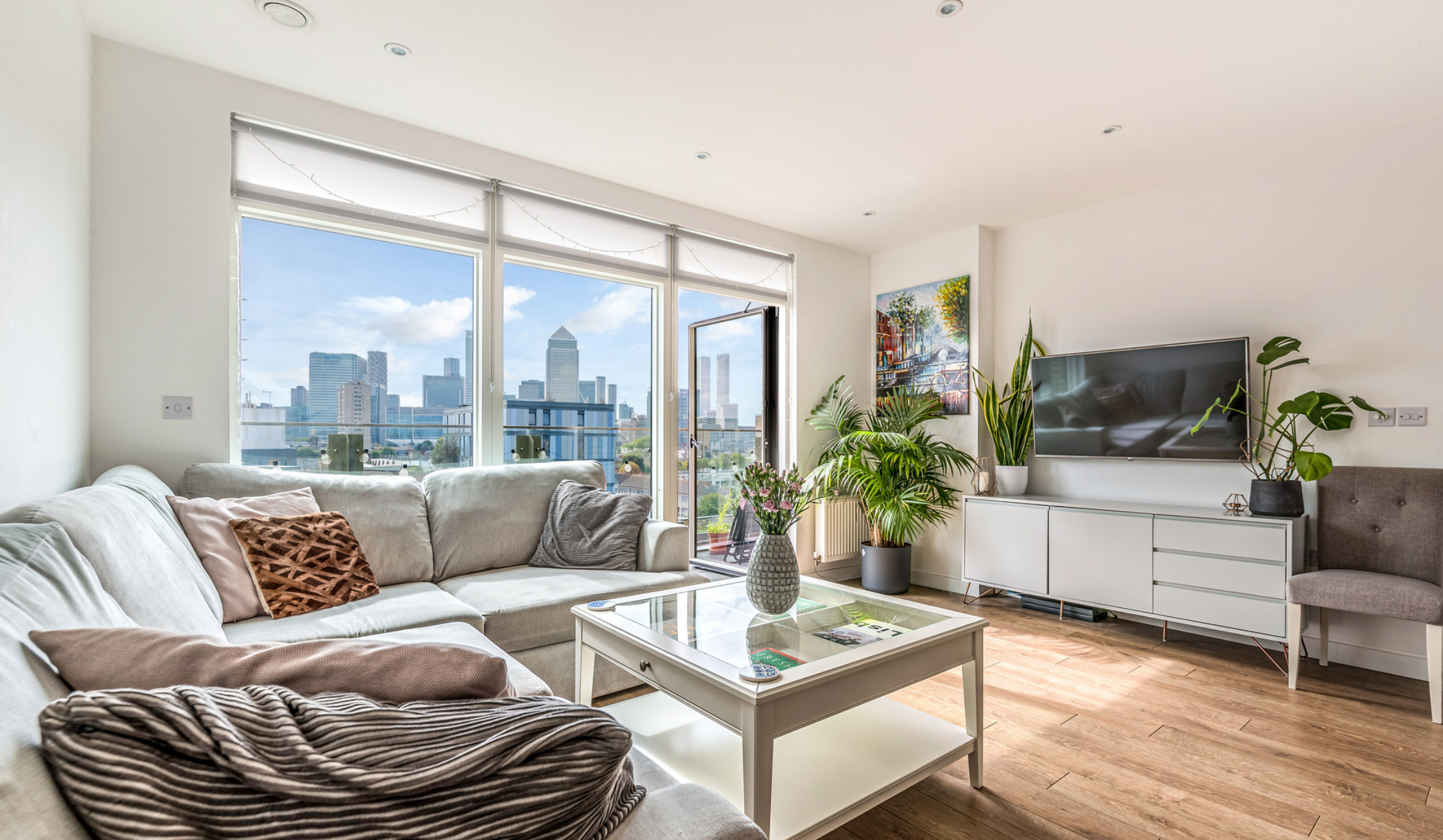
BANBURY POINT E14 2 bedroom apartment