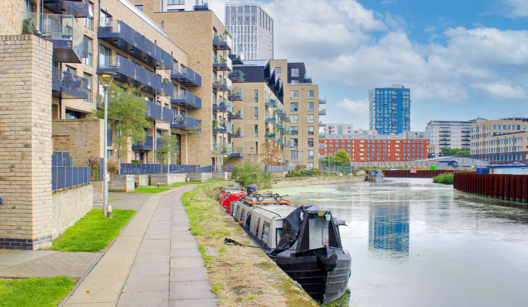
FAIRWAY COURT E3 1 bedroom apartment