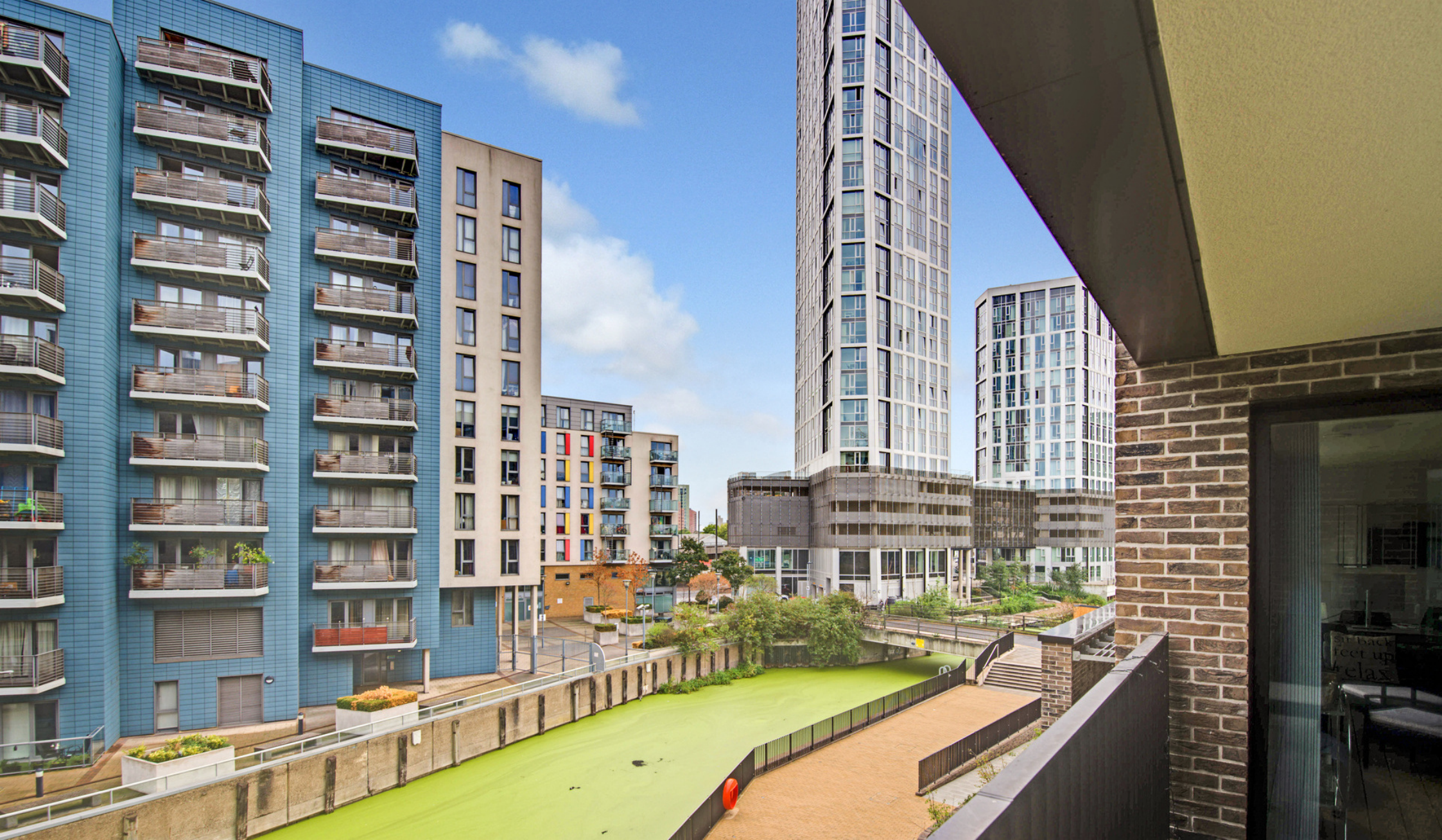
PAVILIONS COURT E15 2 bedroom apartment