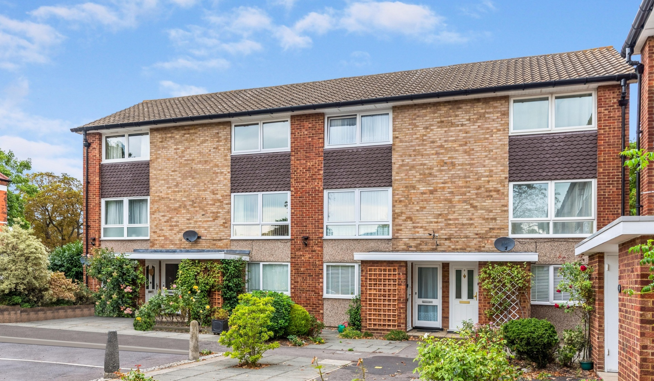
BROMLEY COURT BR1 2 bedroom apartment