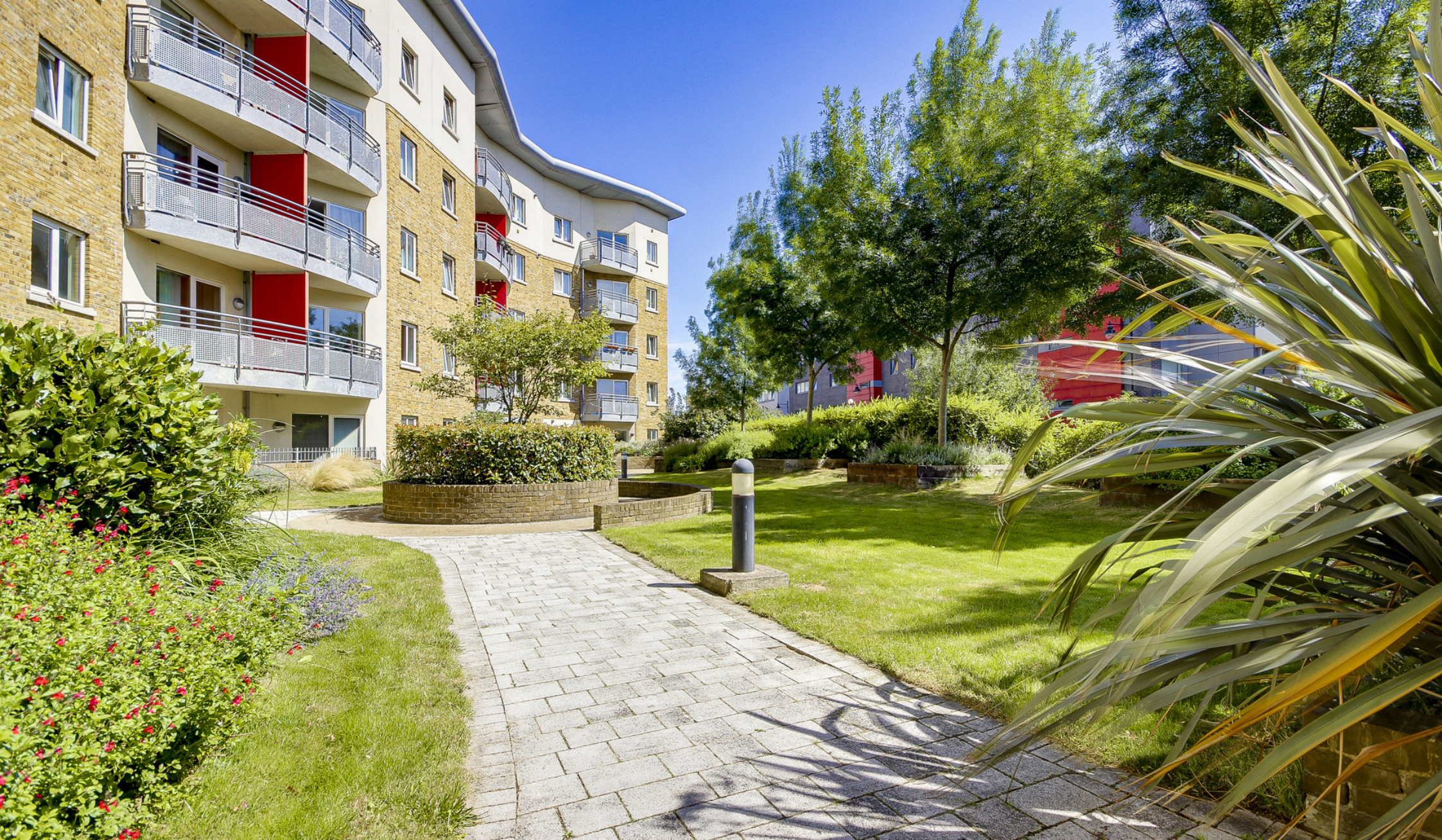
JOHN BELL TOWER WEST E3 2 bedroom apartment