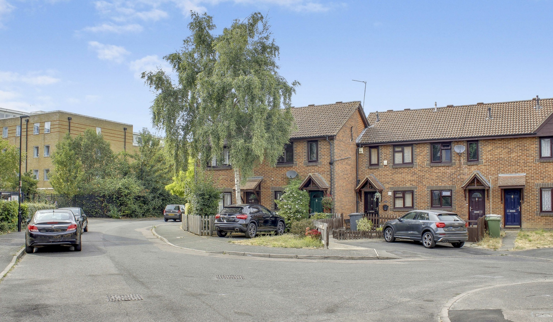
SOUTHERNGATE WAY SE14 2 bedroom terraced house