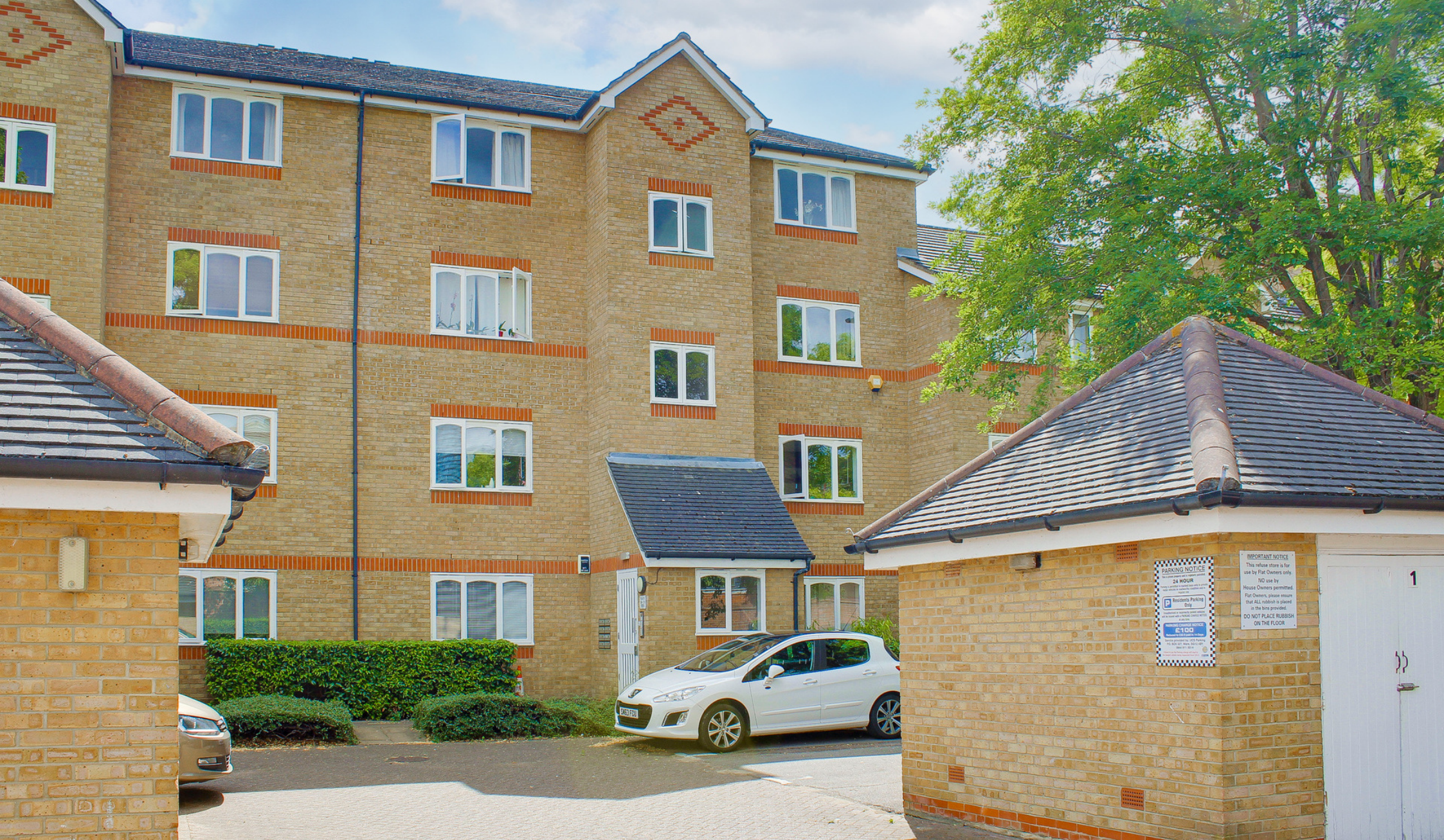
TELEGRAPH PLACE E14 1 bedroom apartment