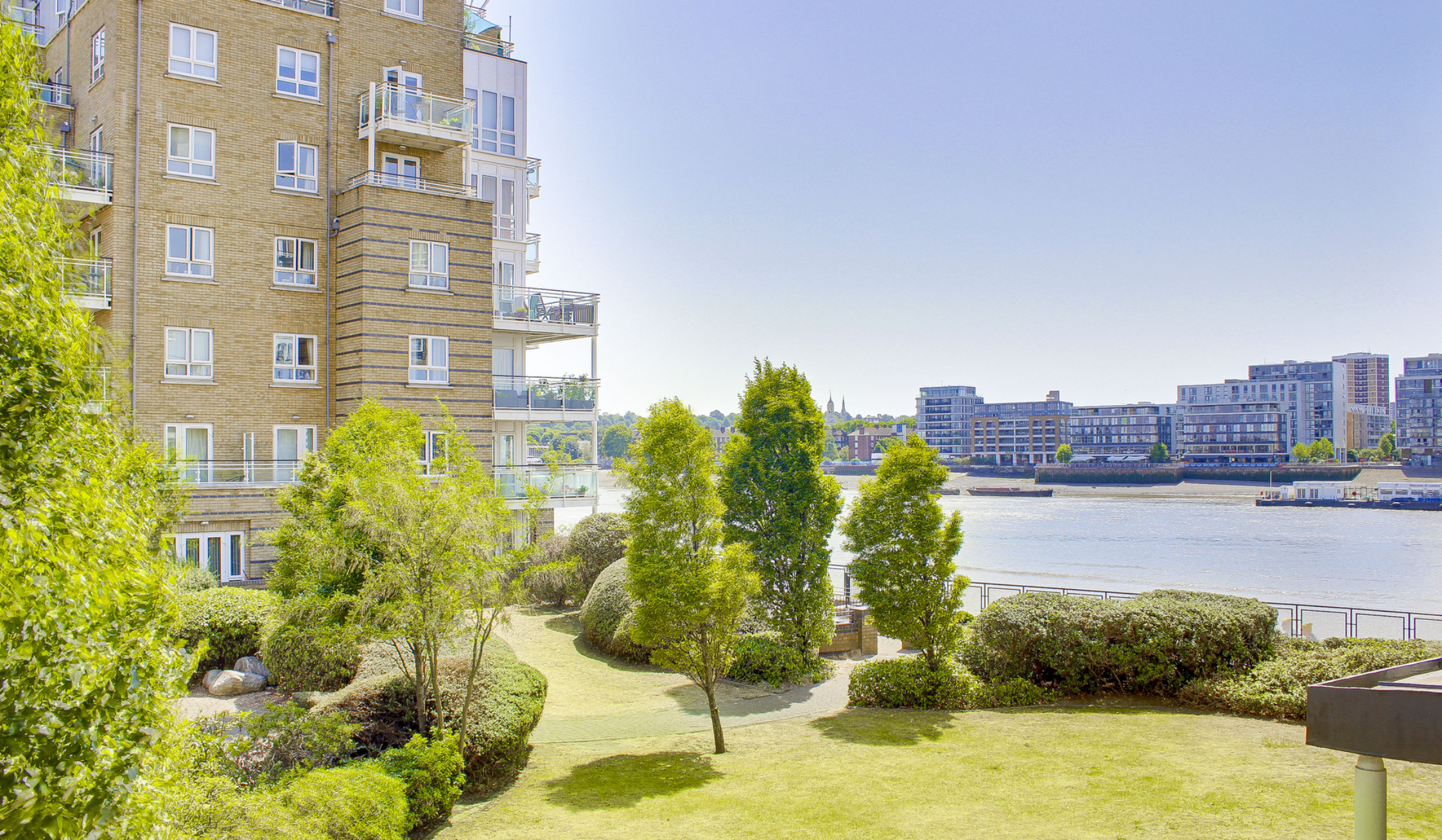
KIRKLAND HOUSE E14 2 bedroom apartment