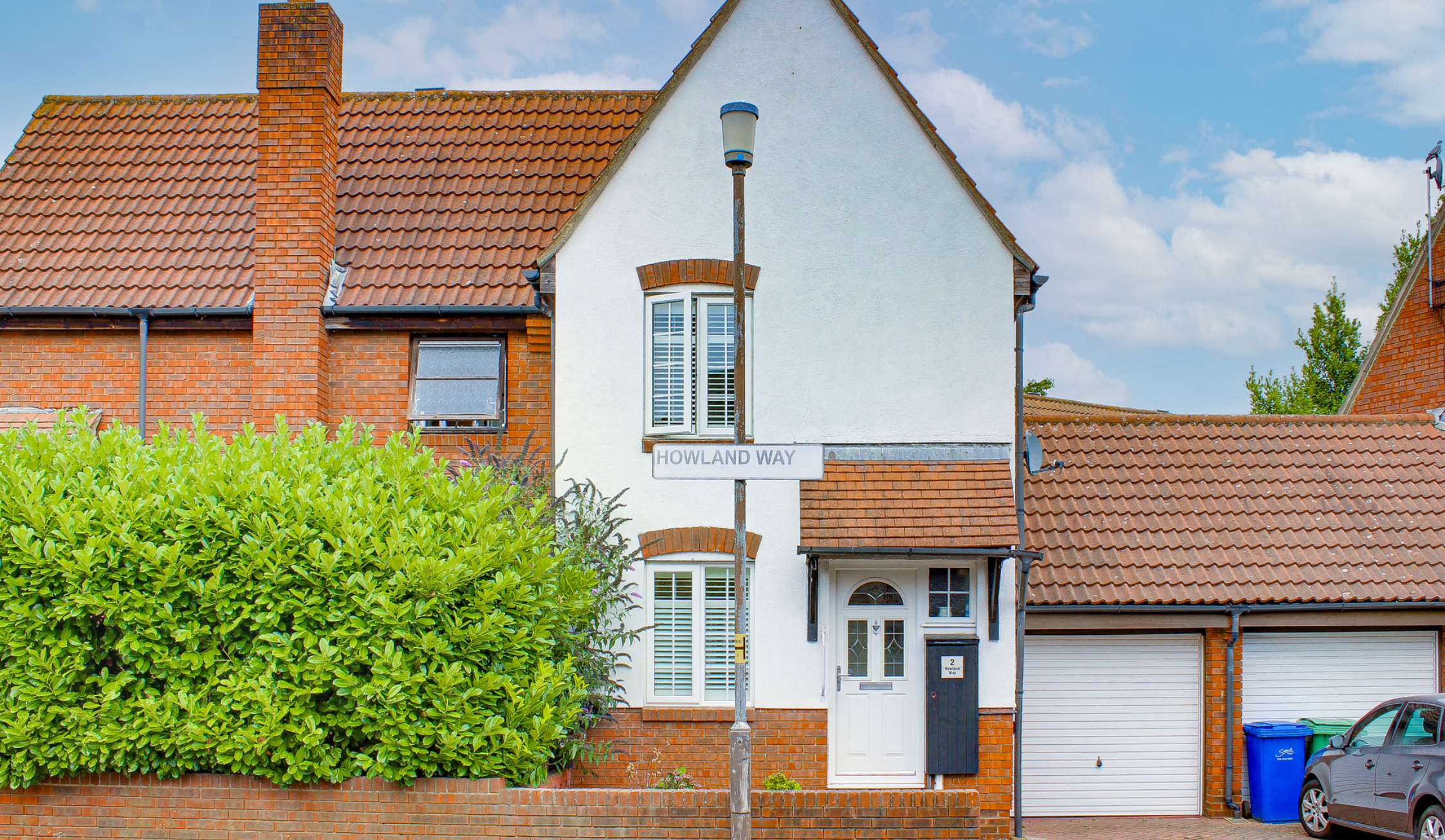
HOWLAND WAY SE16 2 bedroom semi-detached house