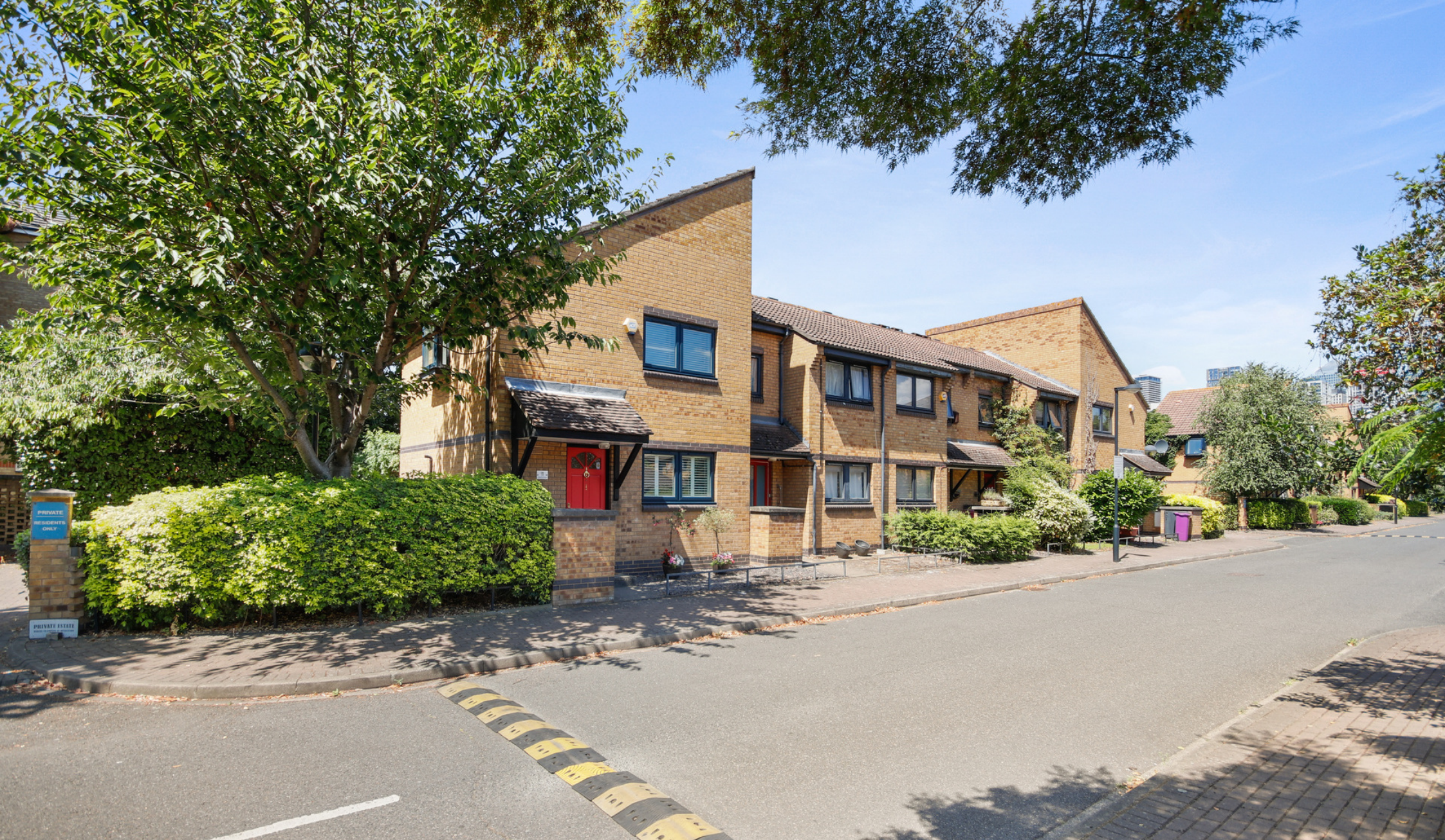
TAEPING STREET E14 2 bedroom end of terrace