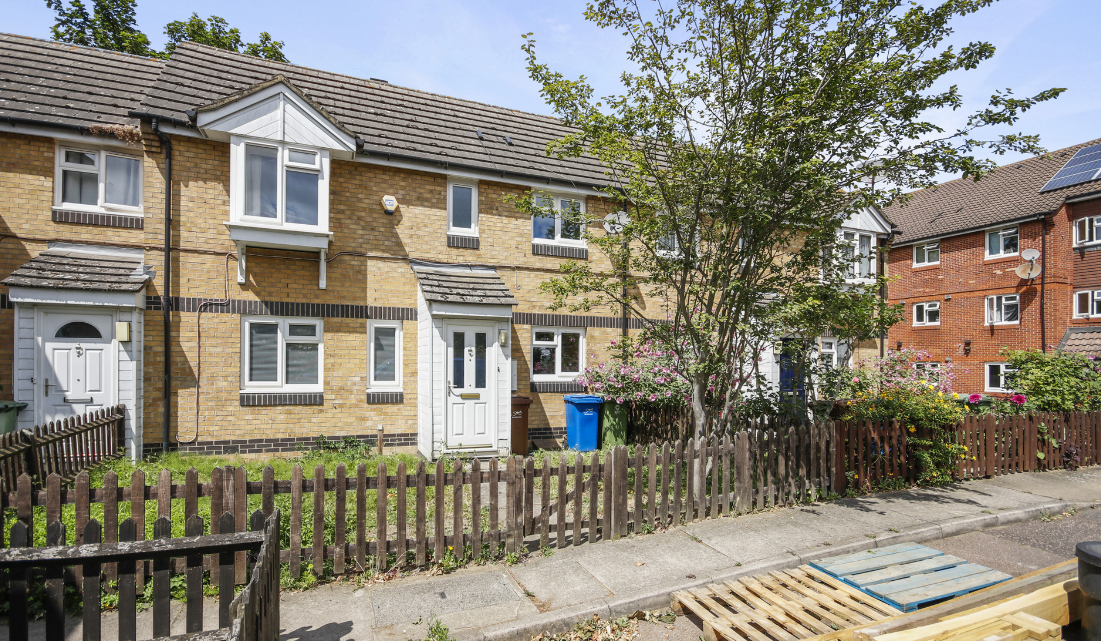
STEVENSON CRESCENT SE16 2 bedroom terraced house