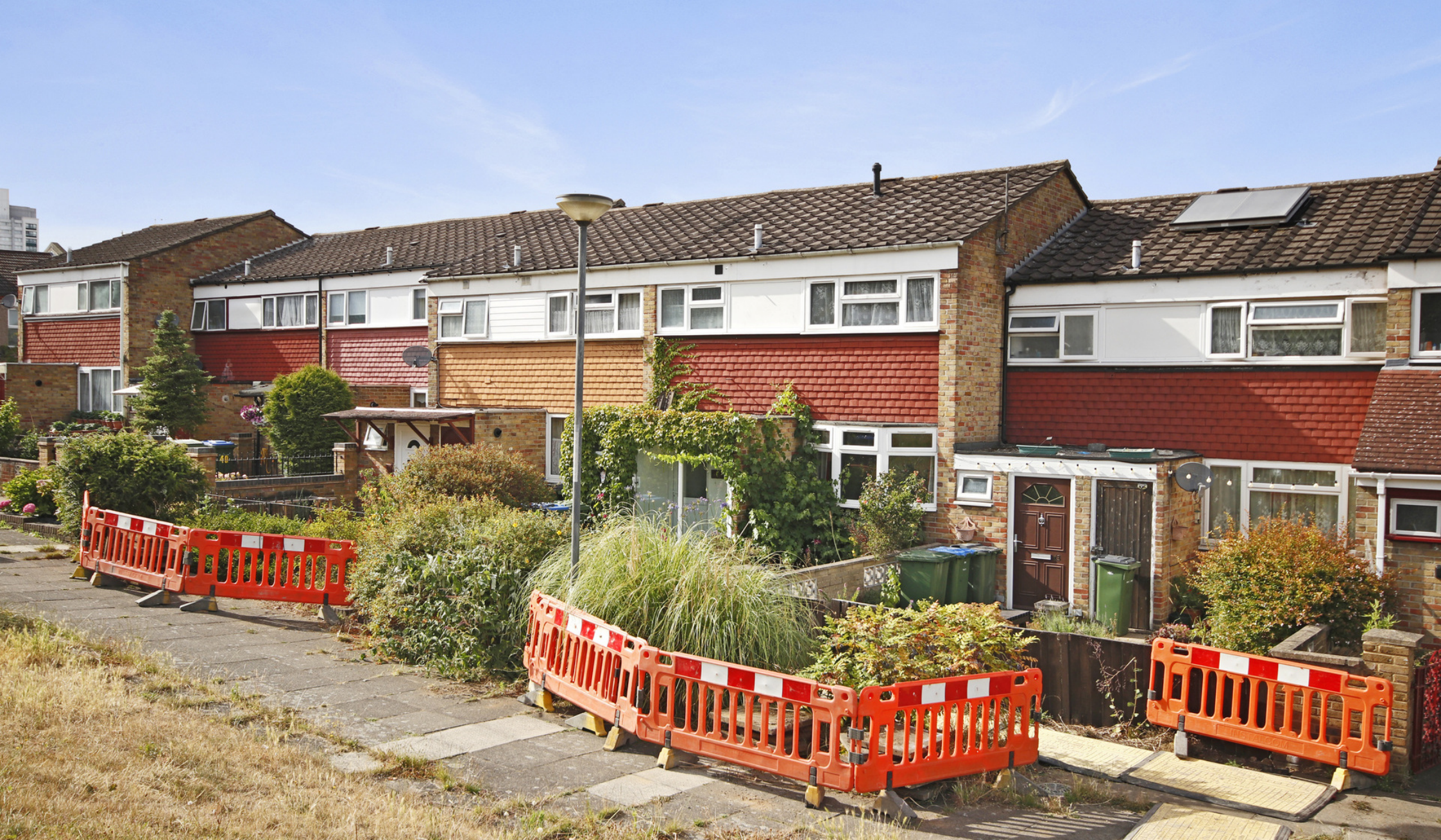
ORISSA ROAD SE18 3 bedroom terraced house