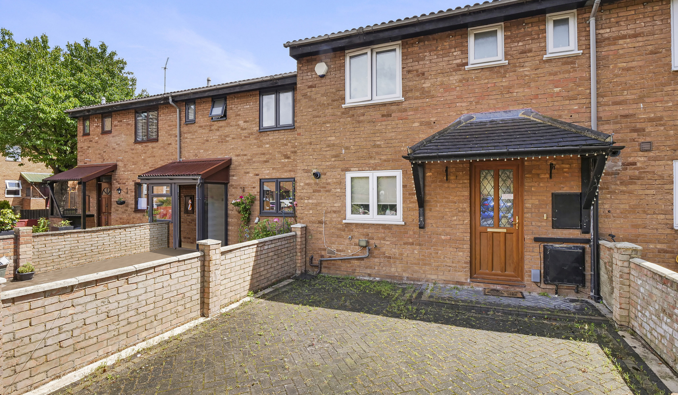
GROSVENOR WHARF ROAD E14 2 bedroom terraced house