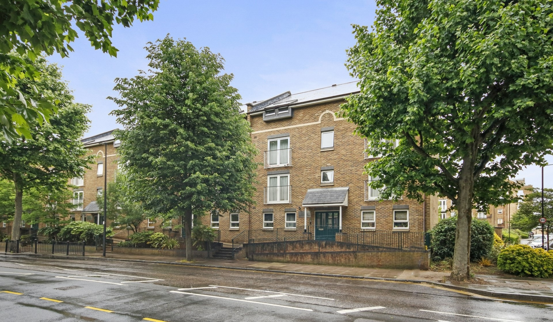
VERWOOD LODGE E14 2 bedroom apartment