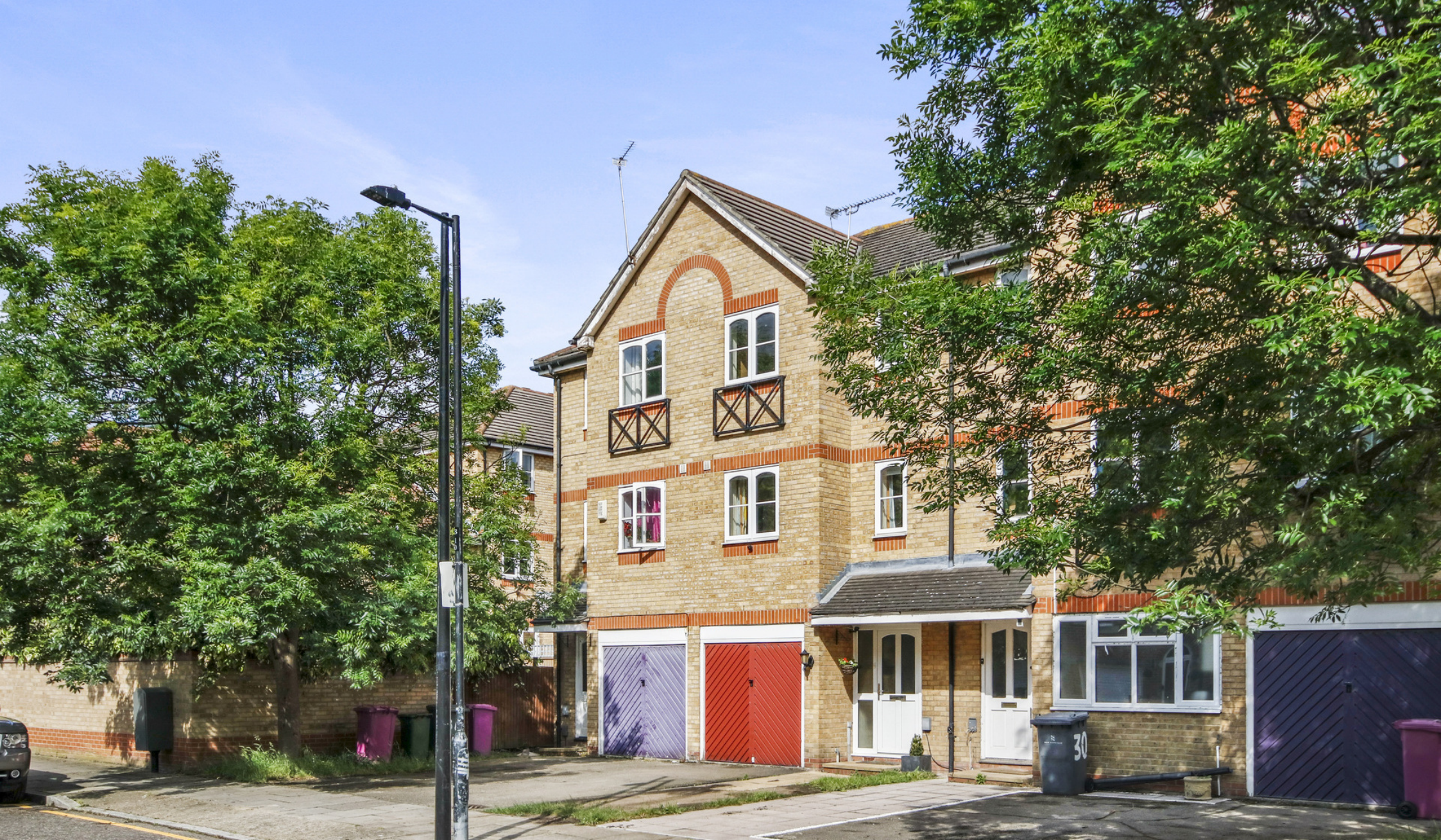
BARNSDALE AVENUE E14 3 bedroom town house