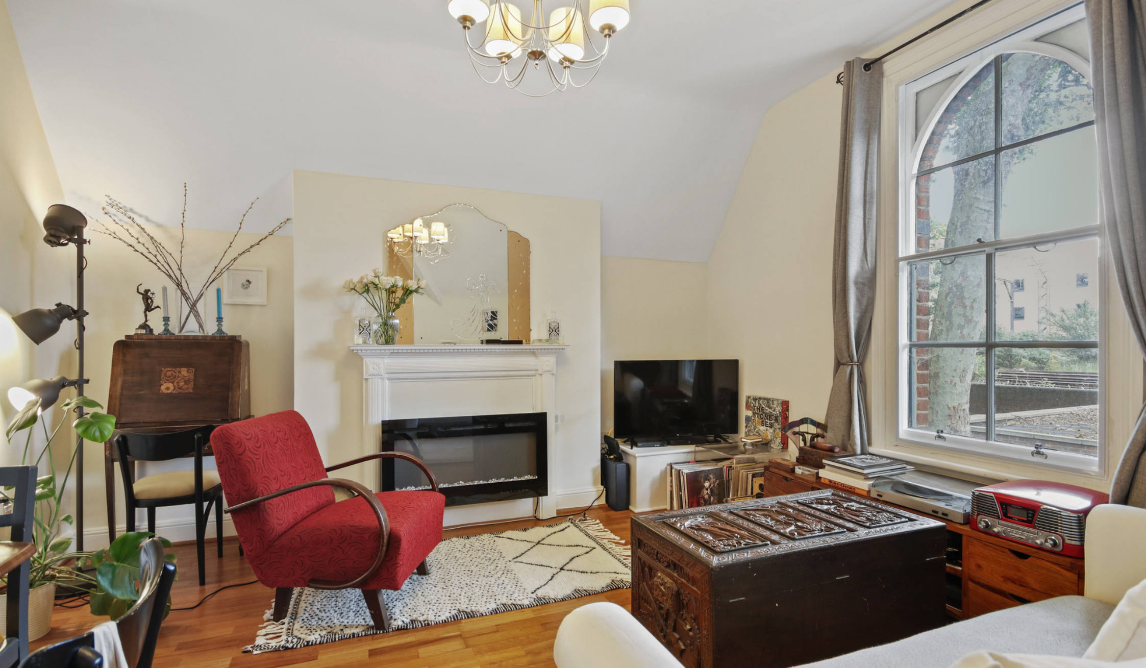
BOW QUARTER E3 1 bedroom apartment