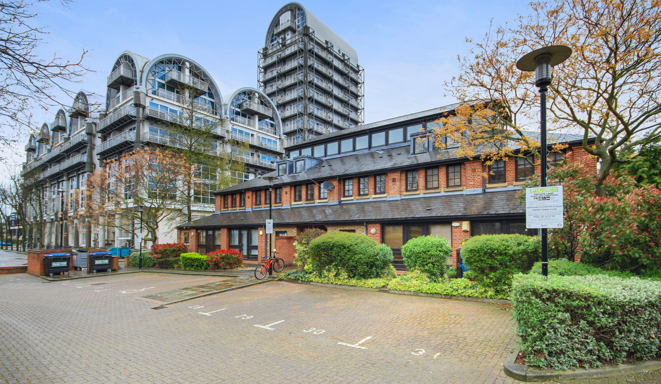
MAST COURT SE16 1 bedroom apartment