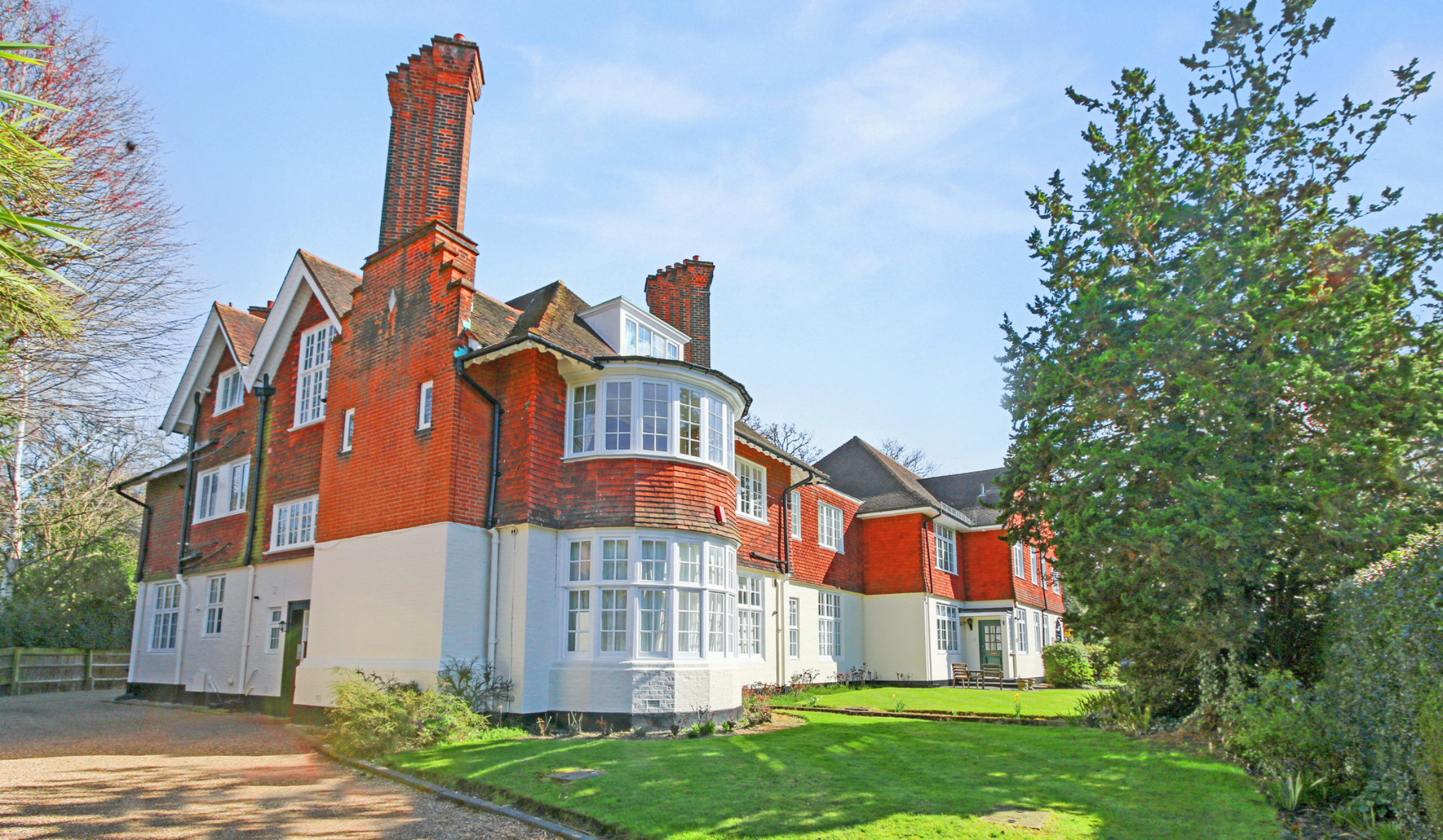
MOORLANDS BR7 3 bedroom apartment