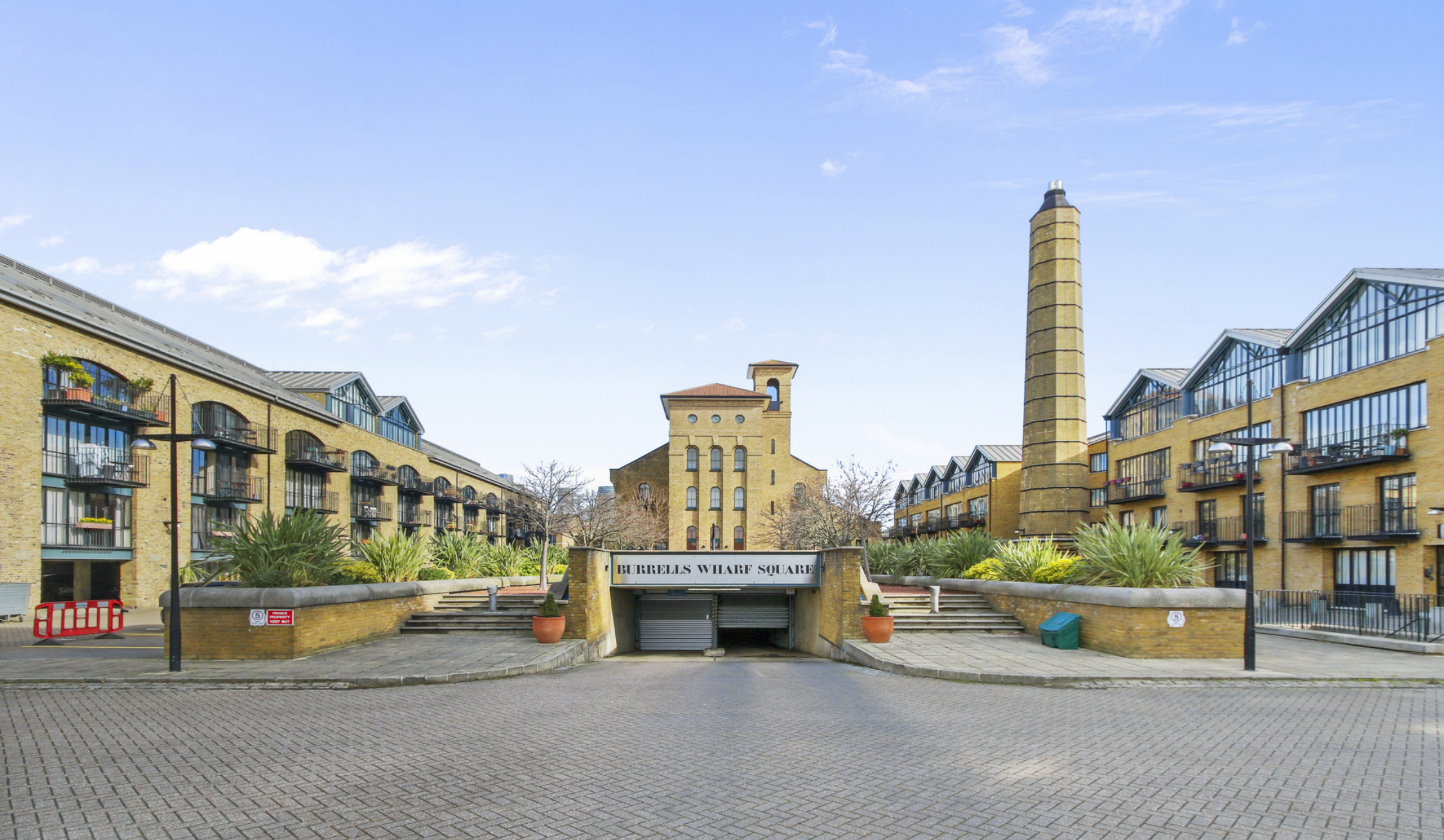
CHART HOUSE E14 studio apartment