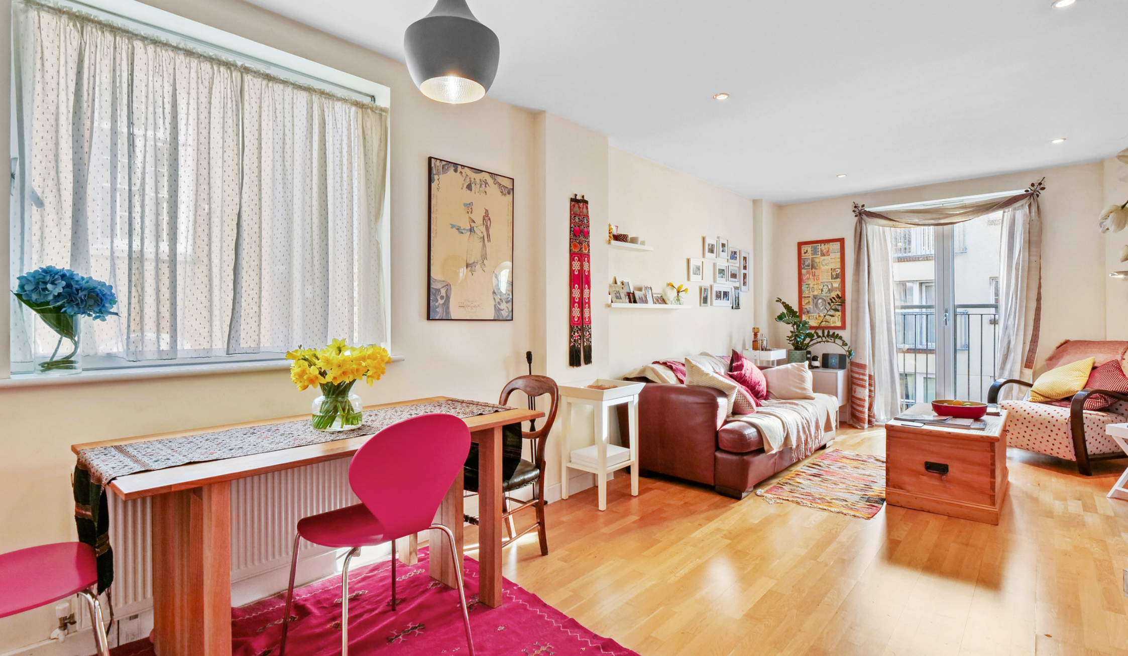
SCHOOL HOUSE E14 2 bedroom apartment