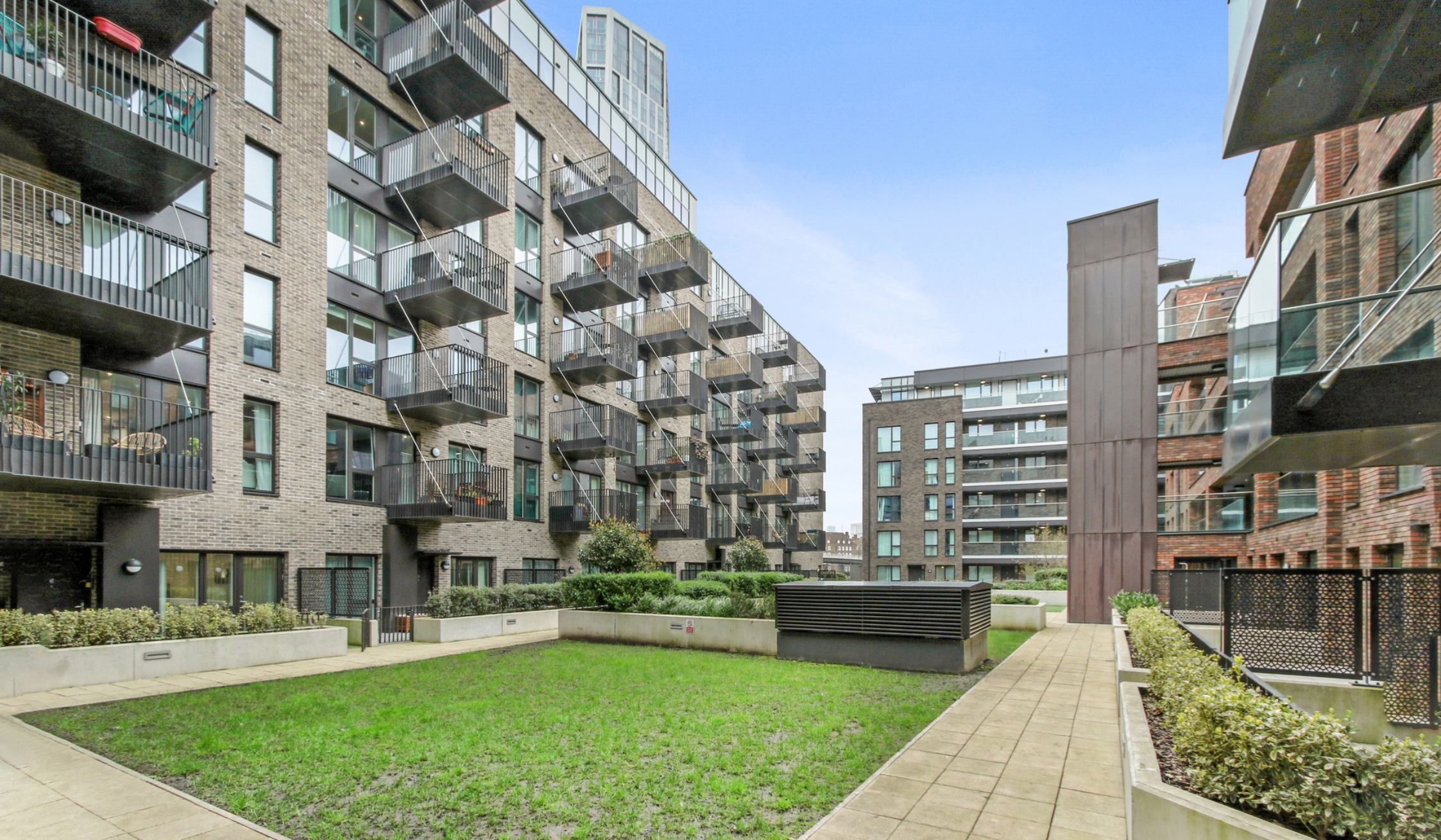
SOUTHMERE HOUSE E15 1 bedroom apartment