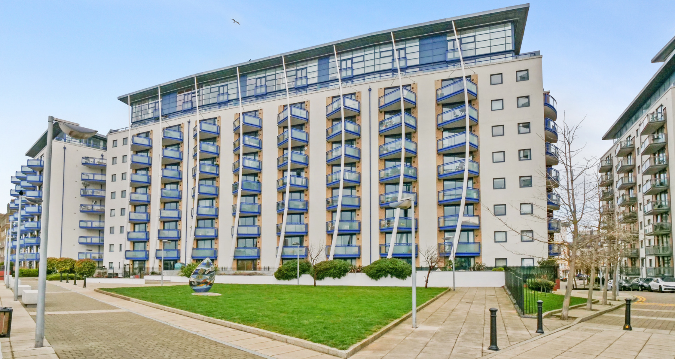
APOLLO BUILDING E14 2 bedroom apartment