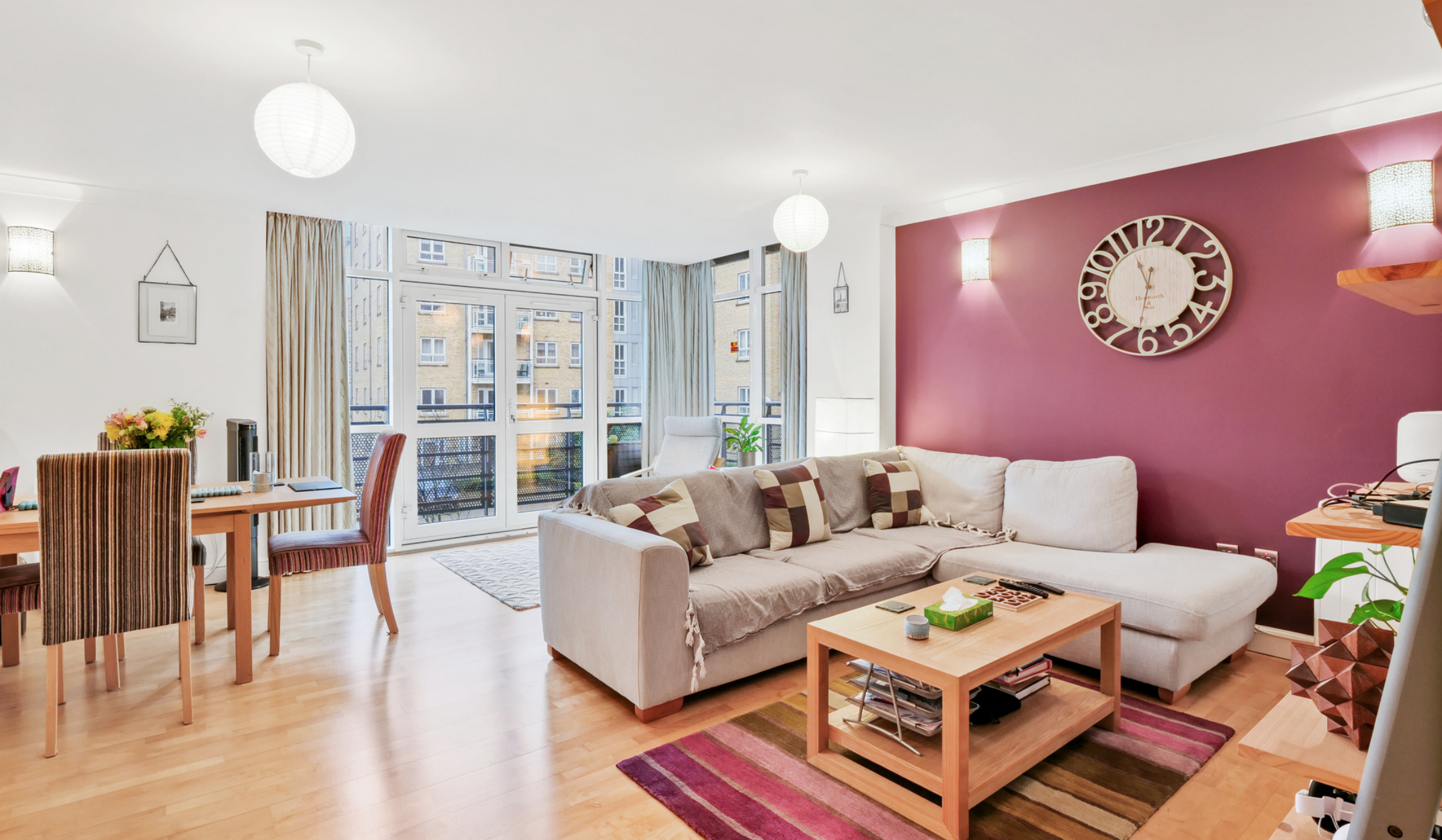
LANGBOURNE PLACE E14 2 bedroom apartment