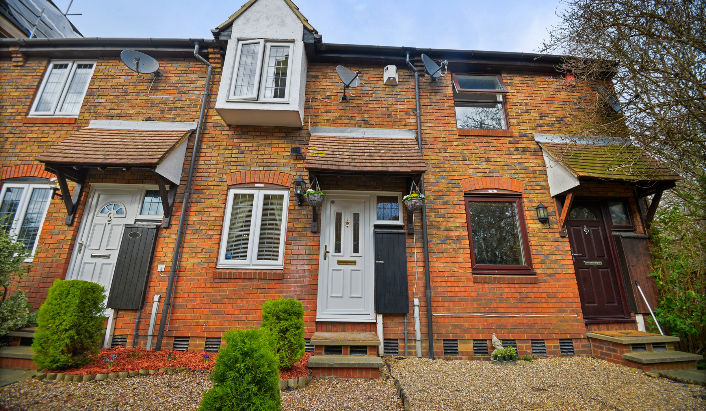
REVELEY SQUARE SE16 2 bedroom terraced house