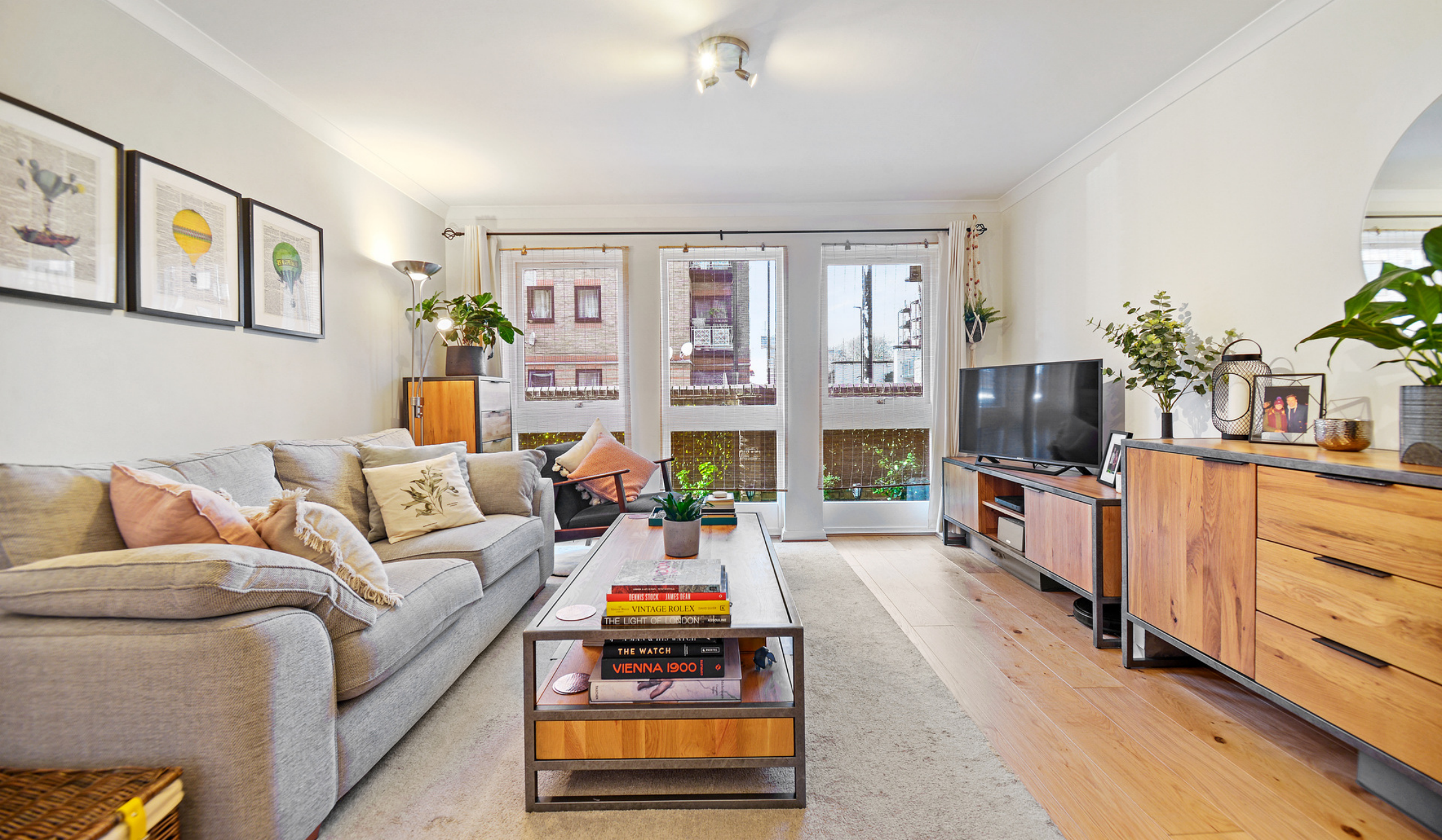
GOODHART PLACE E14 1 bedroom apartment