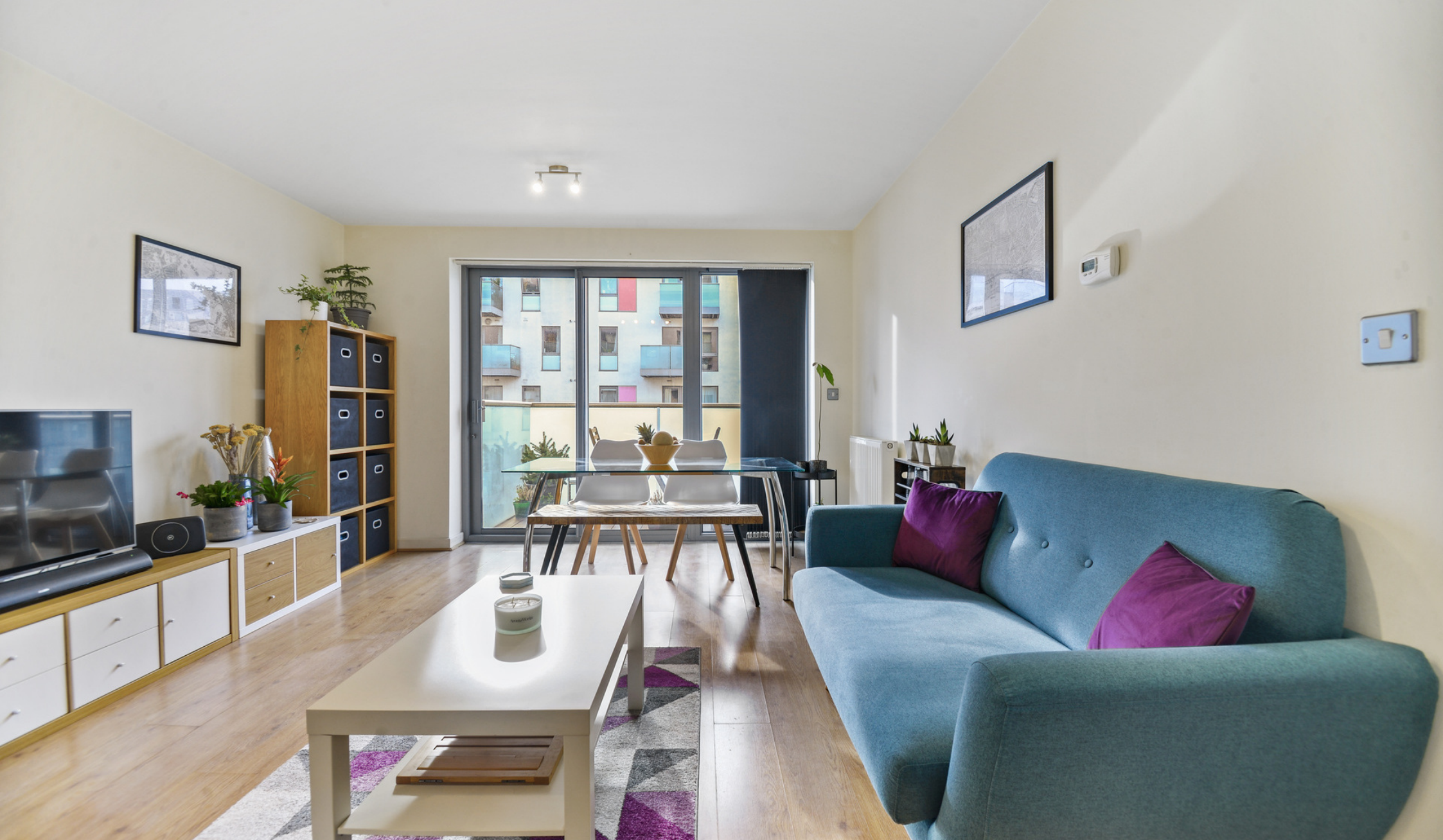
ABBOTTS WHARF E14 1 bedroom apartment