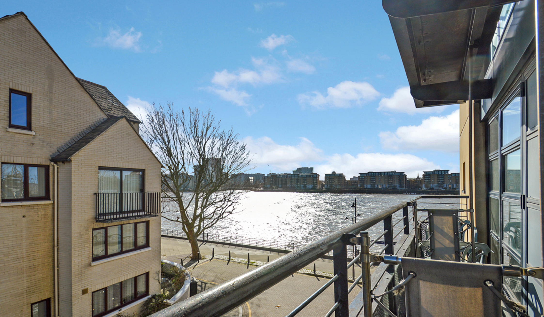
CHART HOUSE E14 2 bedroom apartment