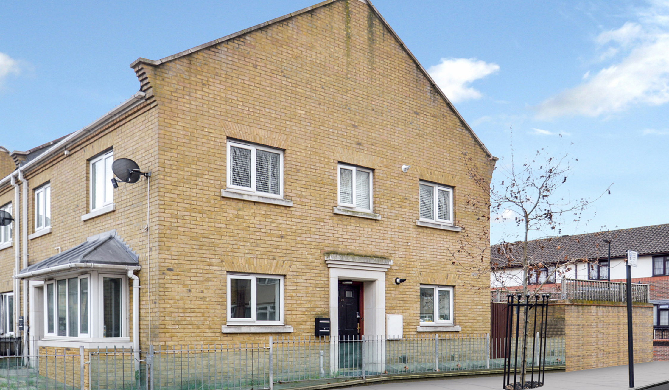
DEE STREET E14 1 bedroom maisonette