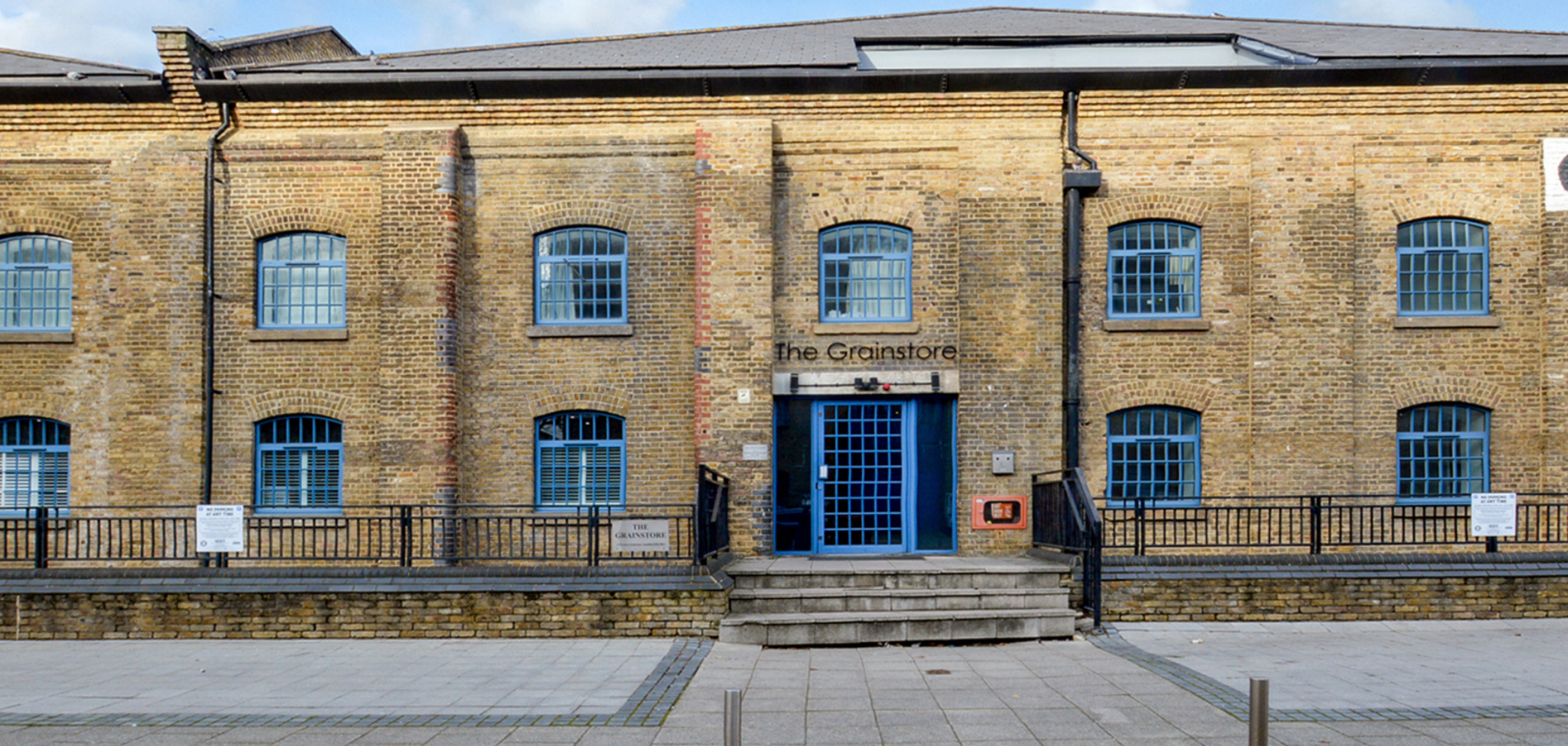
THE GRAINSTORE E16 2 bedroom apartment