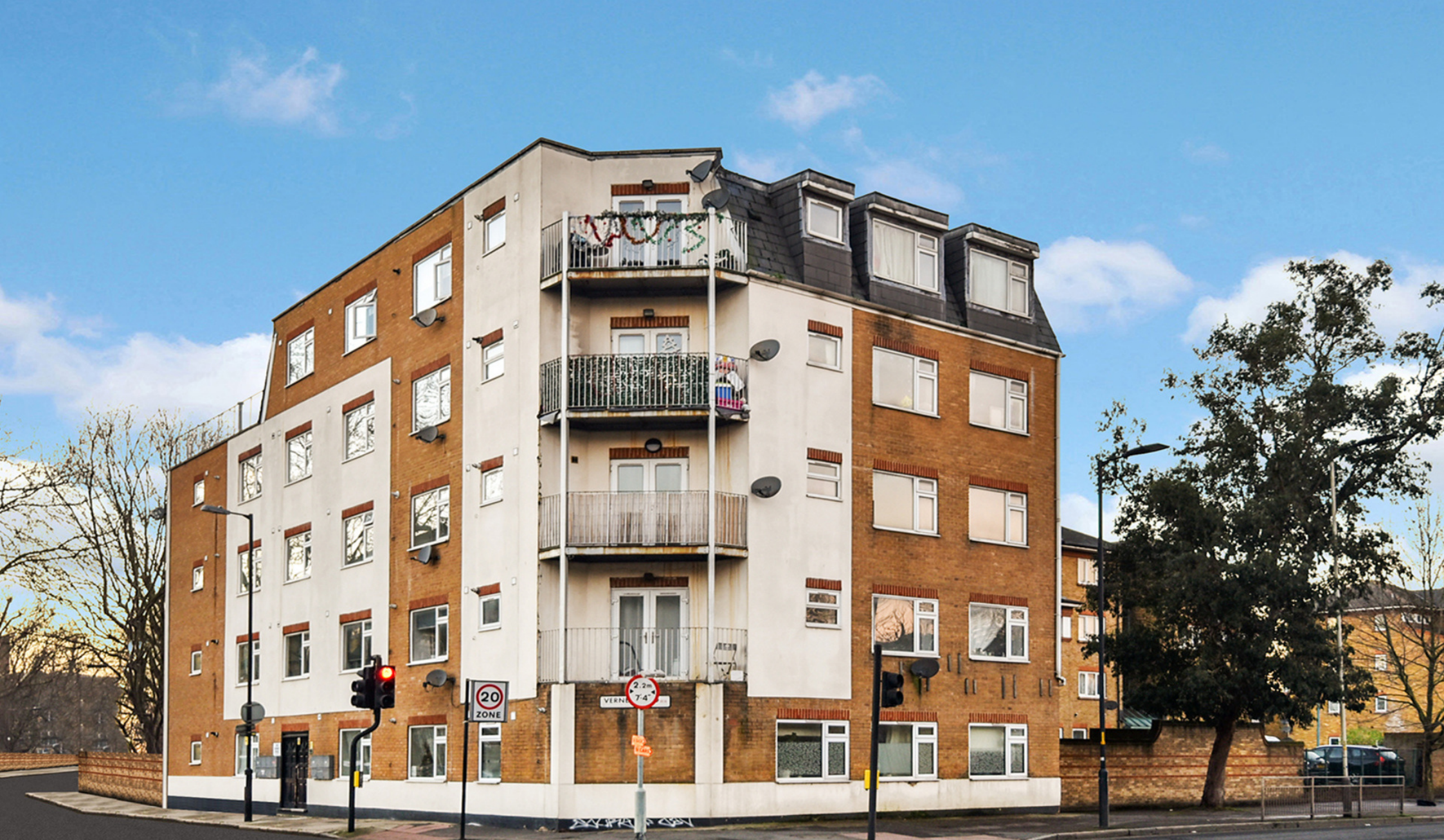
VERNEY ROAD SE16 2 bedroom apartment