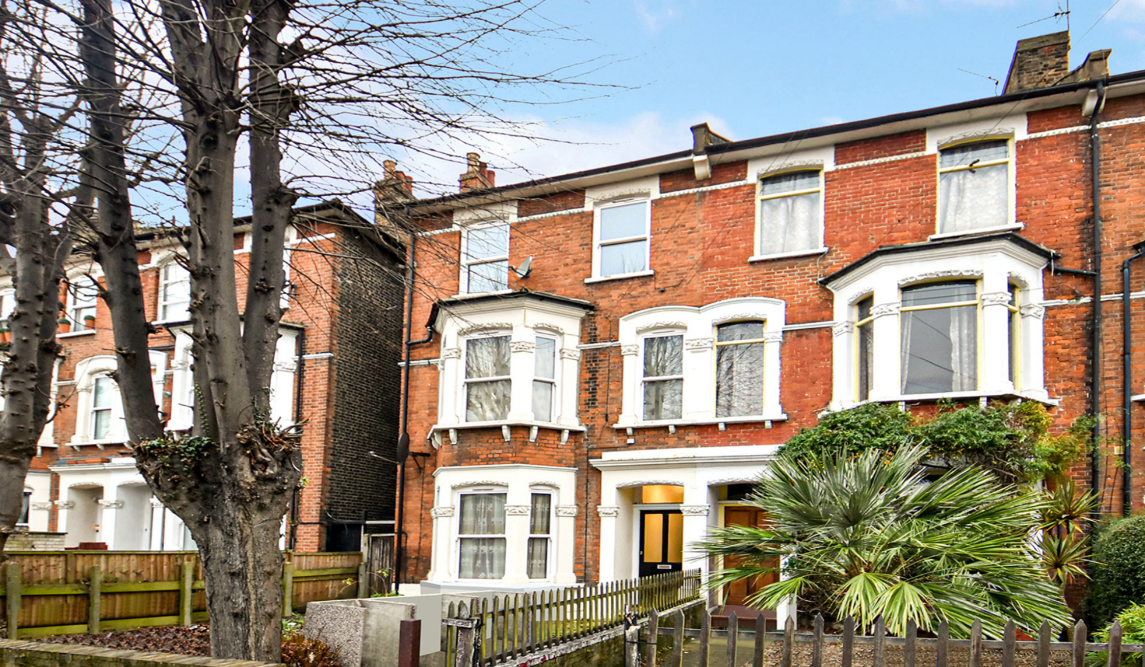
YORK GROVE SE15 1 bedroom apartment