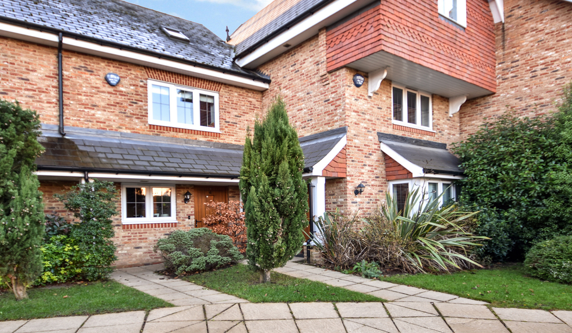
PARKLAND MEWS BR7 3 bedroom terraced house