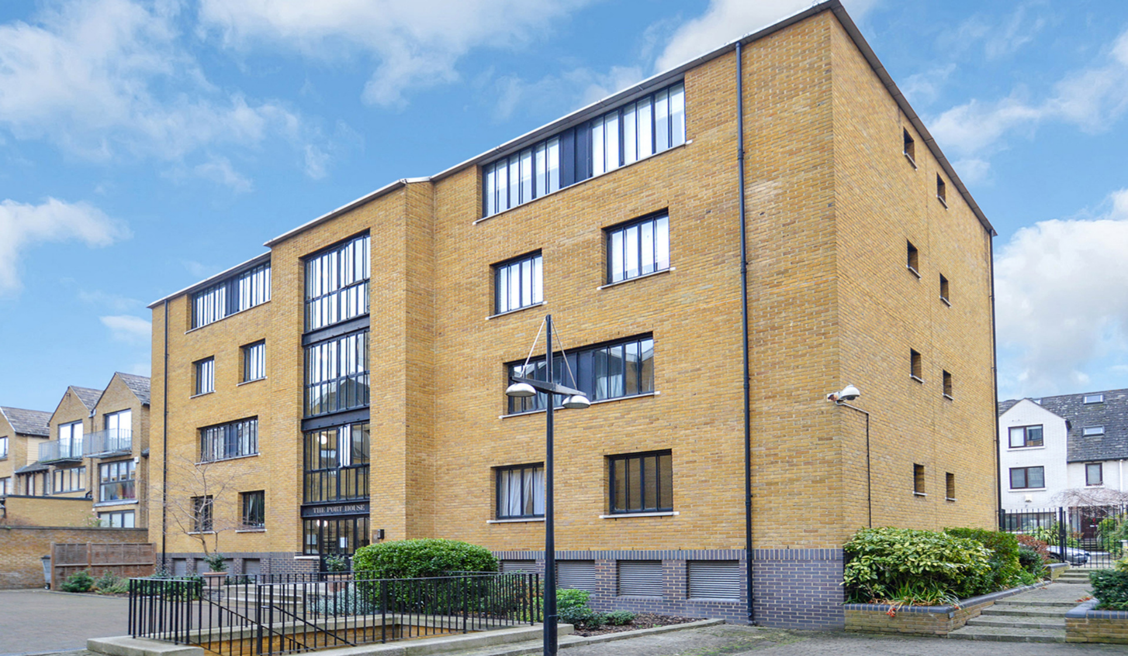
PORT HOUSE E14 2 bedroom apartment