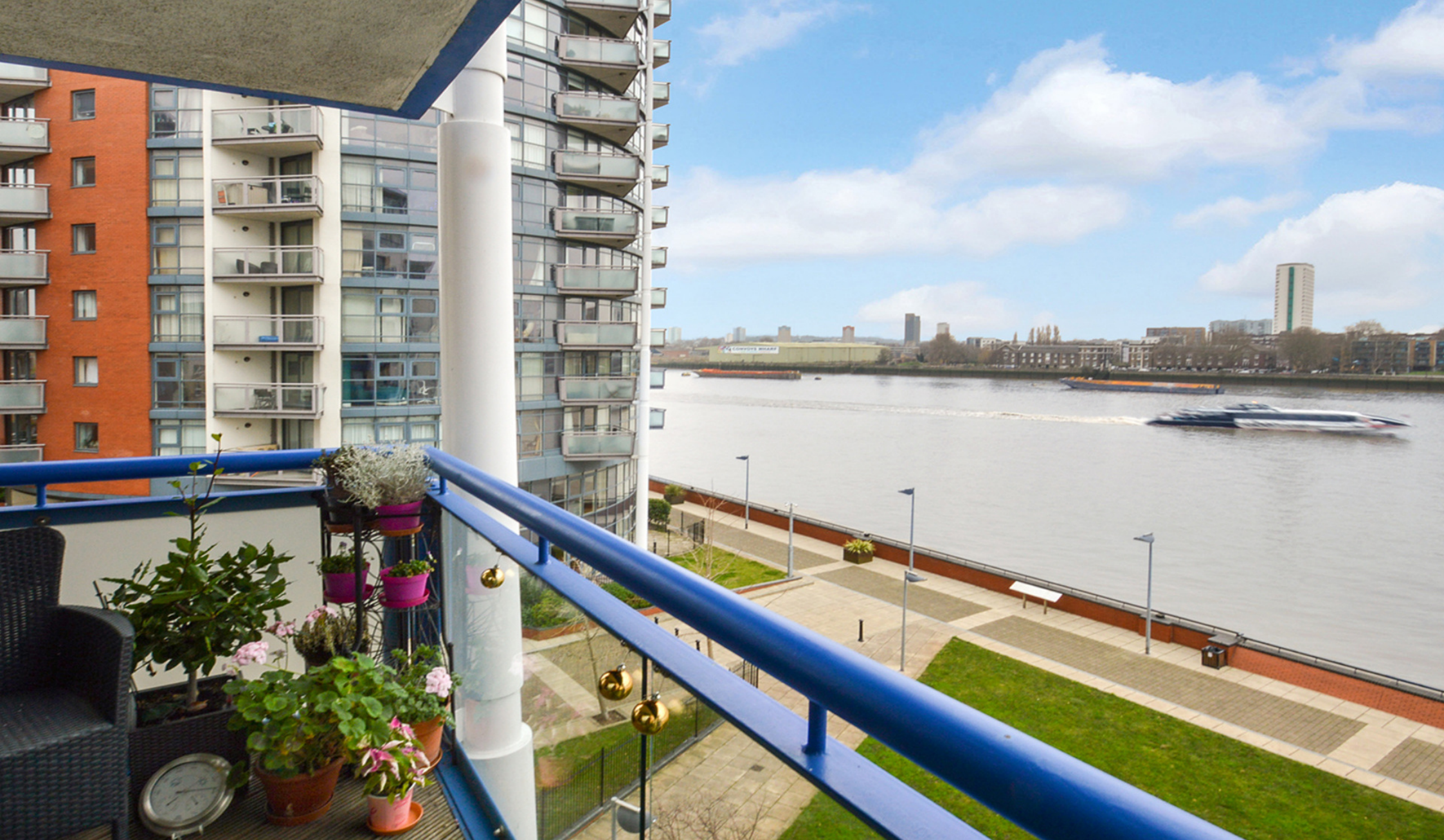
APOLLO BUILDING E14 2 bedroom apartment