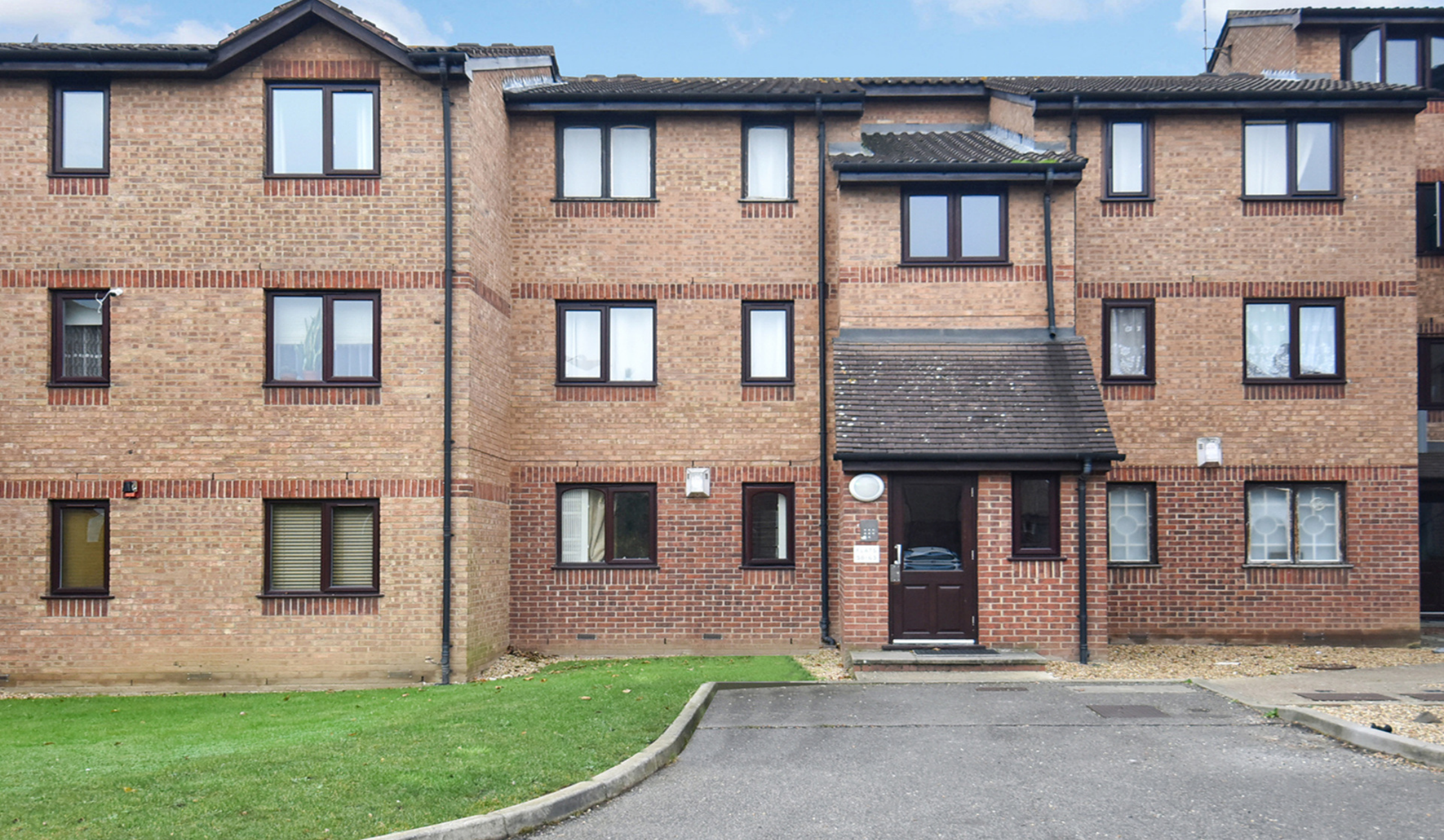
BRIDGE MEADOWS SE14 1 bedroom apartment