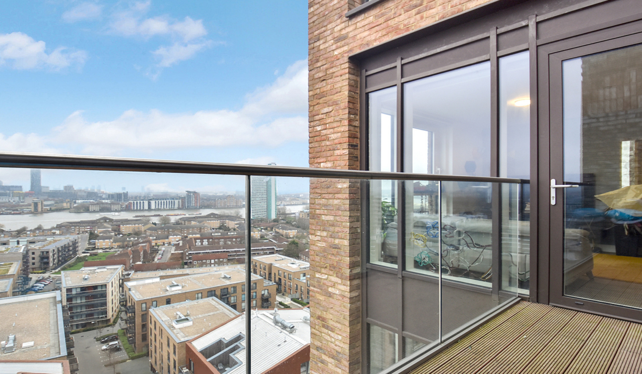
OSLO TOWER SE8 2 bedroom apartment