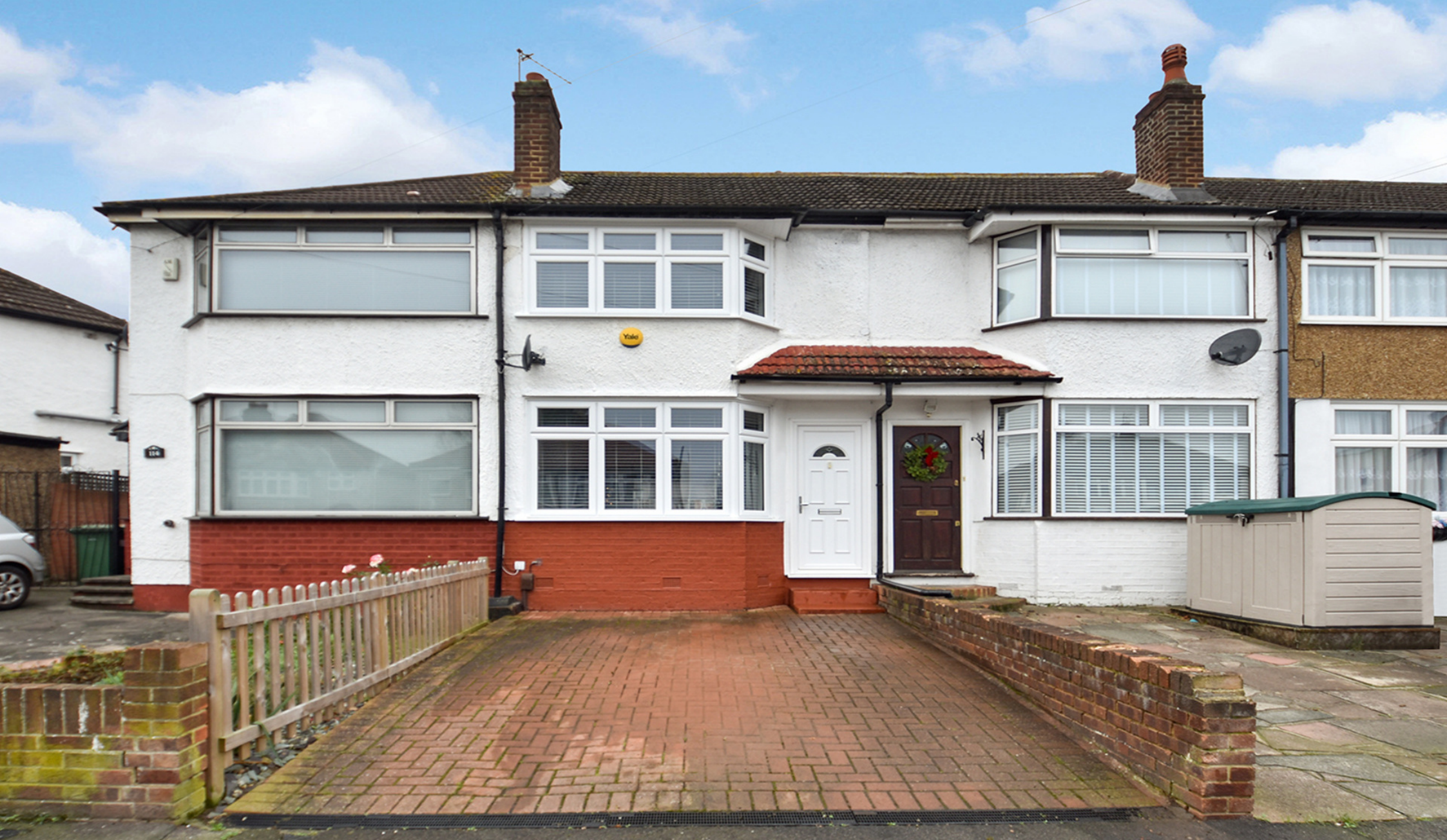
MERLIN ROAD DA16 2 bedroom terraced house